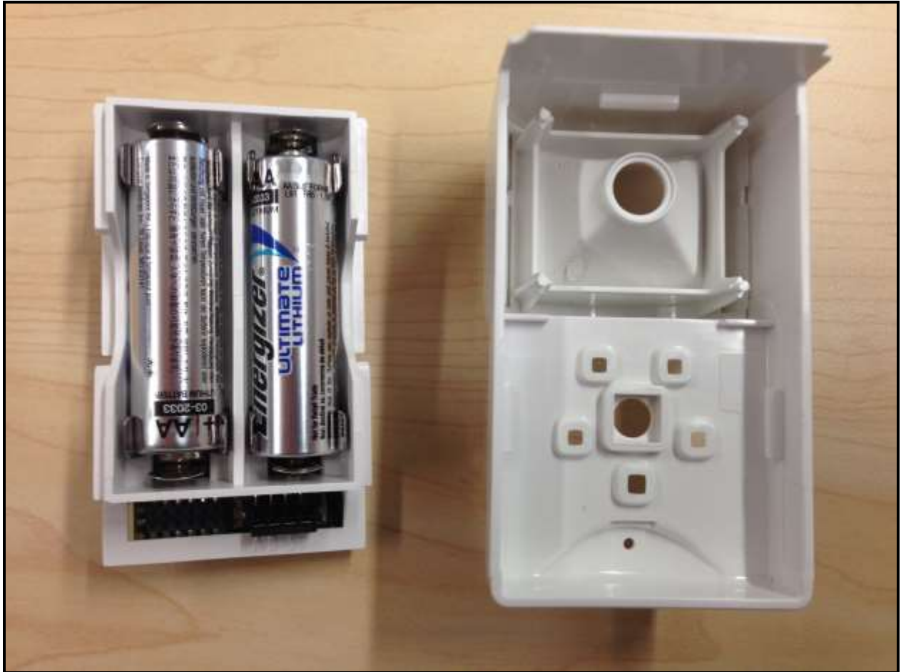
Photograph 6: Battery Compartment