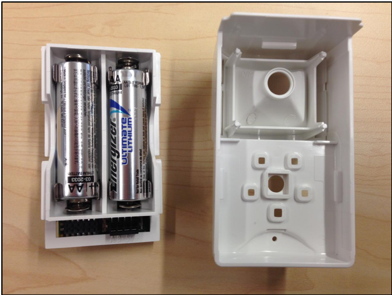
Photograph 5: Battery Compartment