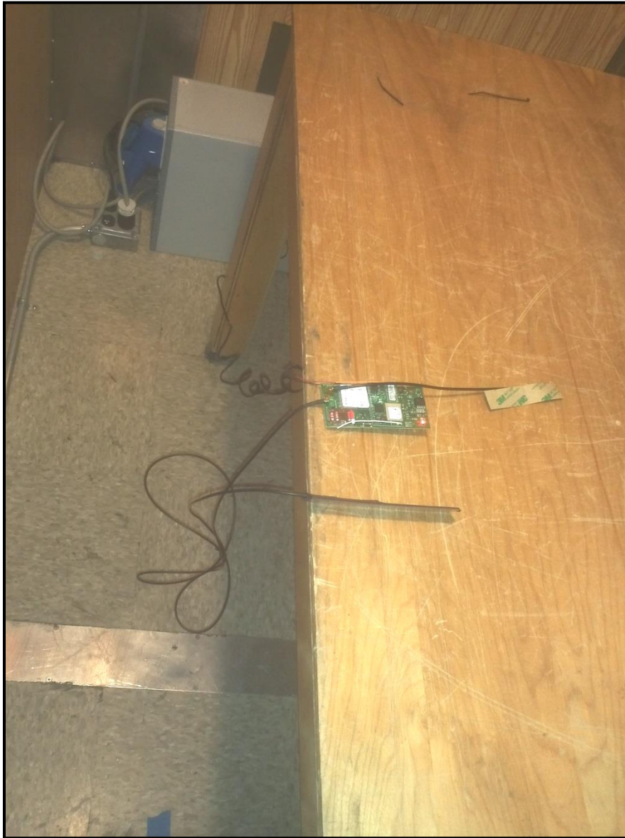
Photograph 6: Conducted AC Testing – Back View