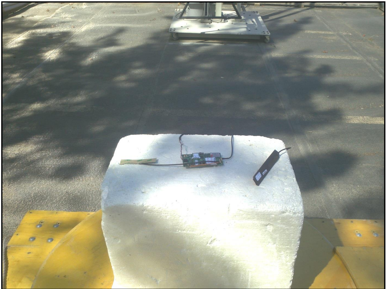
Photograph 3: Radiated Emissions Testing – Front View