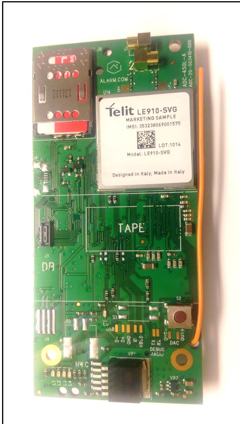
Photograph 11: EUT Front View