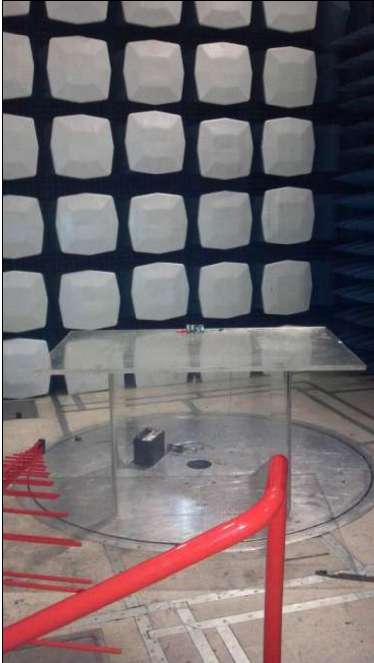
Photograph 1. Radiated Emission, Test Setup