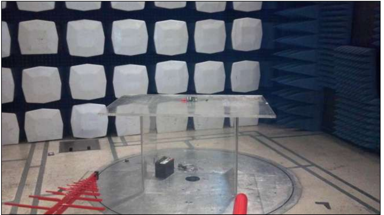
Photograph 1. Radiated Emission, Test Setup