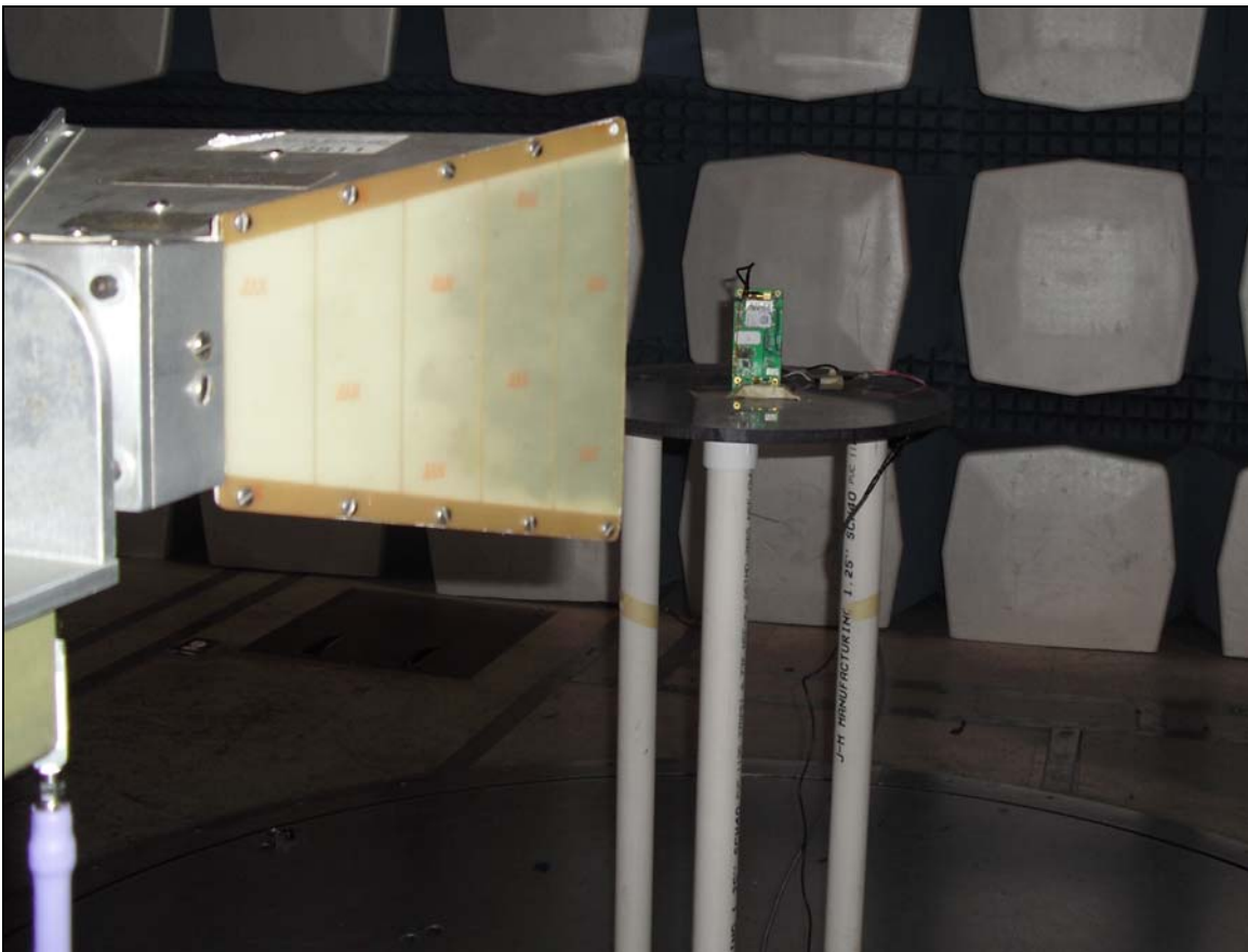
Photograph 4. Spurious Emissions