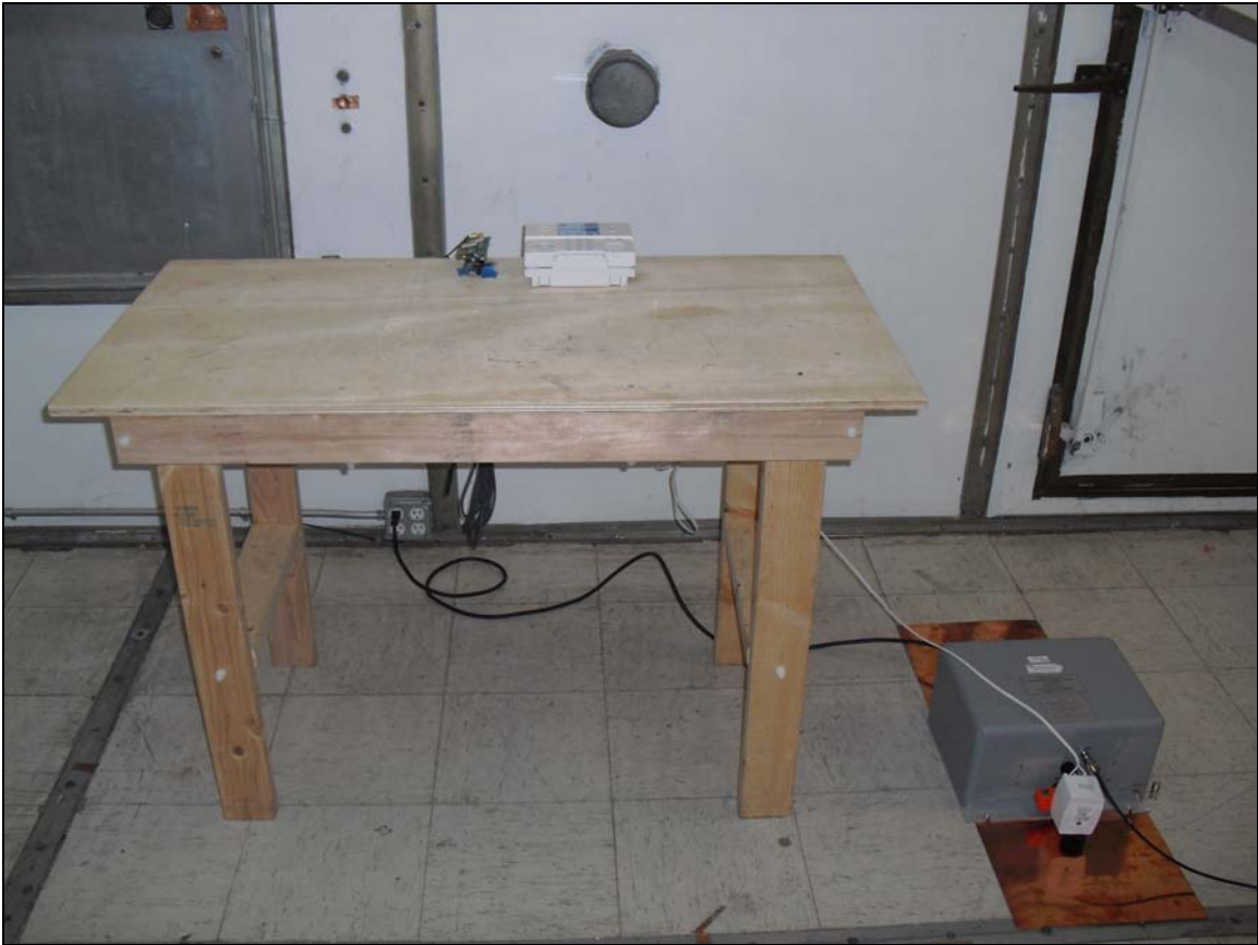
Photograph 1. Conducted Emissions