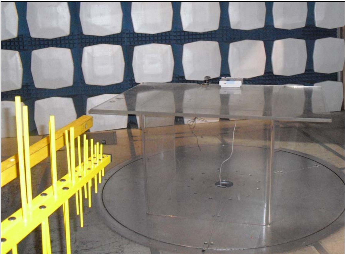
Photograph 2. Radiated Emissions