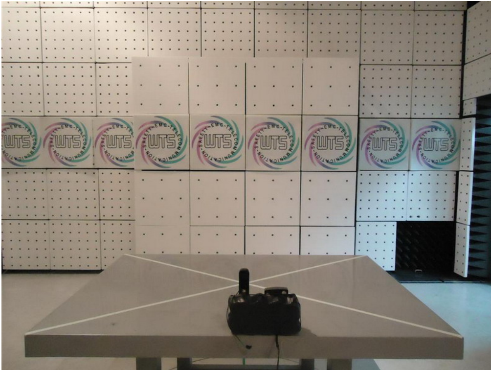
Set Up Photo of Conducted Emission

Registration number: W6M21303-13091-FCC FCC ID: YKRH3EM67