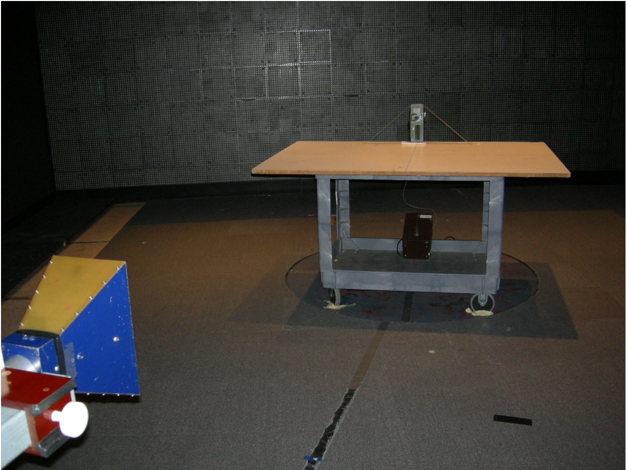
Figure 3: Radiated Emissions