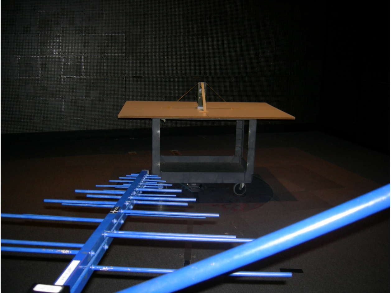
Figure 2: Radiated Emissions