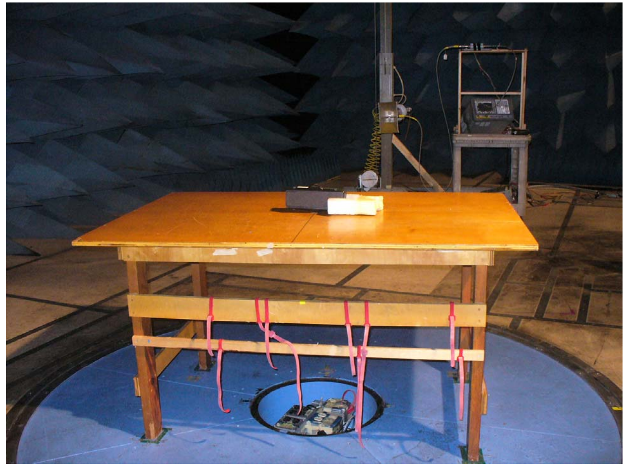
Figure 6: Radiated Emissions – Back View (EUT Side)