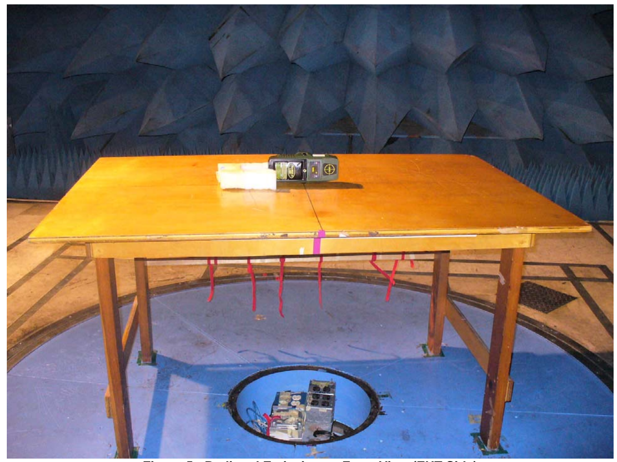
Figure 5: Radiated Emissions – Front View (EUT Side)