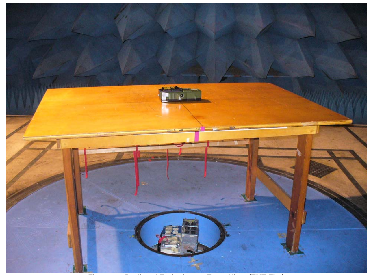
Figure 3: Radiated Emissions – Front View (EUT Flat)