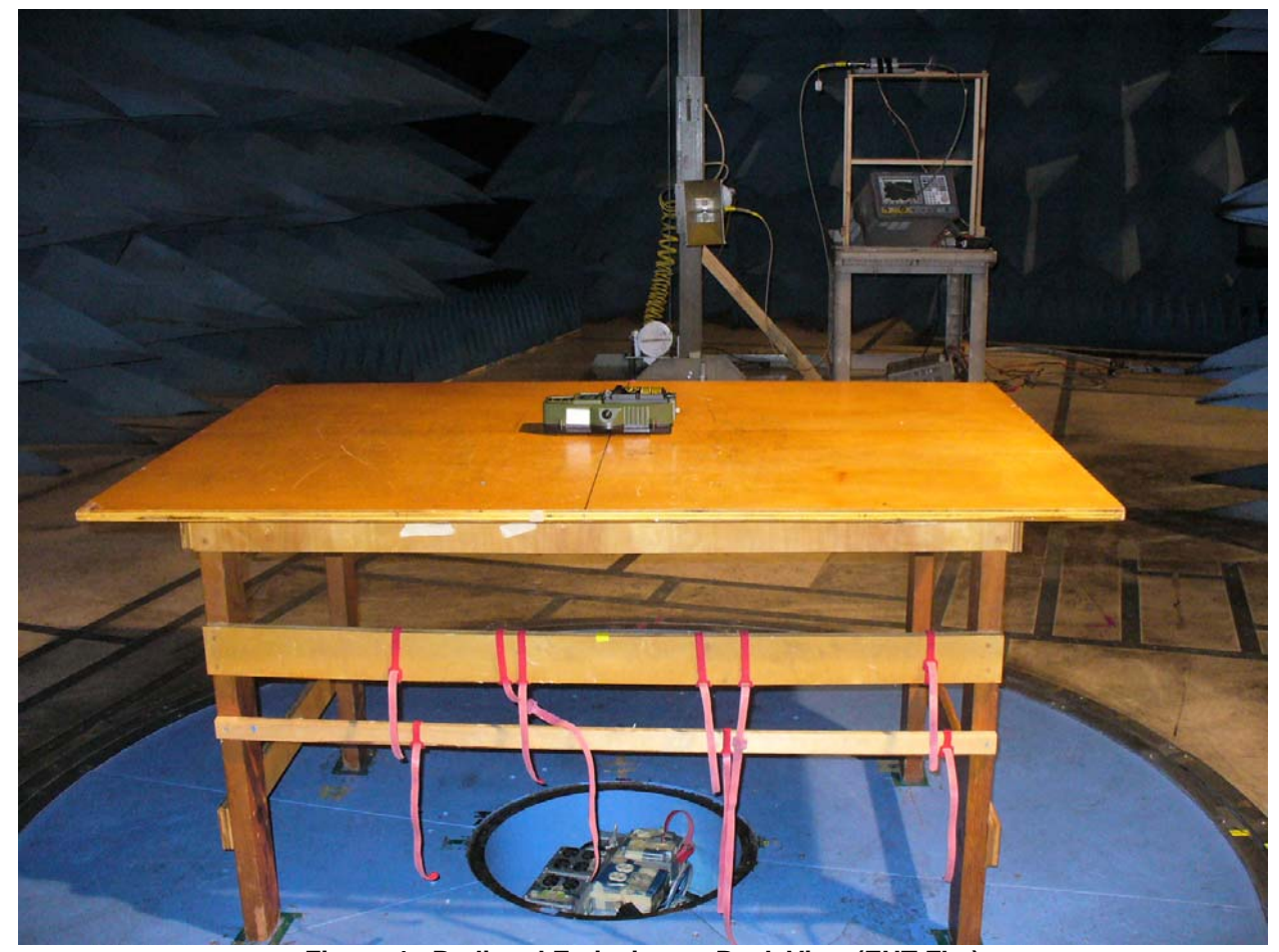
Figure 4: Radiated Emissions – Back View (EUT Flat)