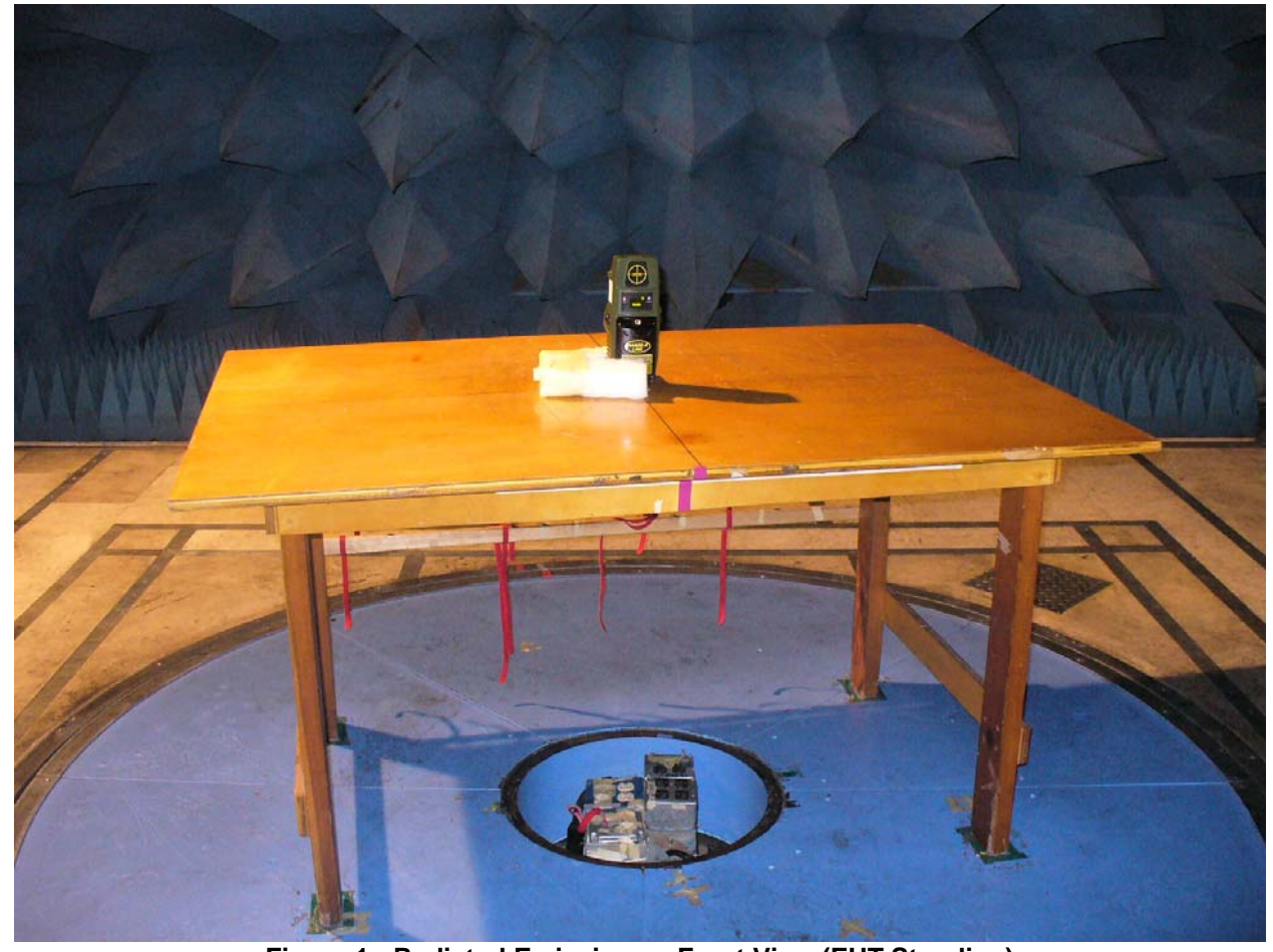
Figure 1: Radiated Emissions – Front View (EUT Standing)