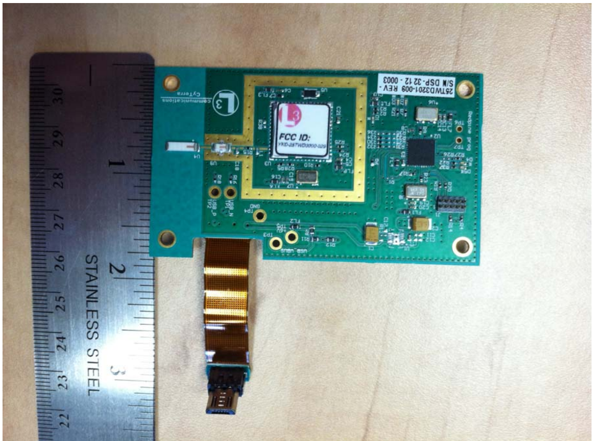
Figure 2: Sample Label Location