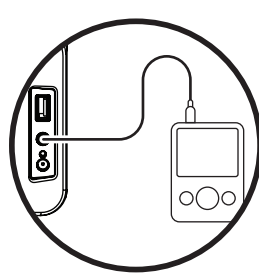
Press the QUX button to select the Aux input.

There is an Aux input on the rear of the unit that allows any analogue device to be connected.