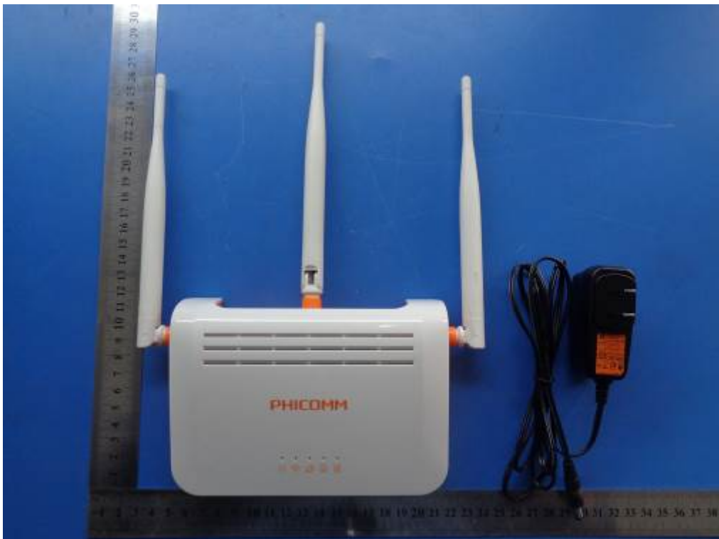
All Packages – Front View