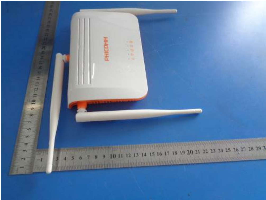
EUT – Left View

Report No.: 14050025-FCC-E Issue Date: June 09, 2014 Page: 25 of 35 www.siemic.com.cn