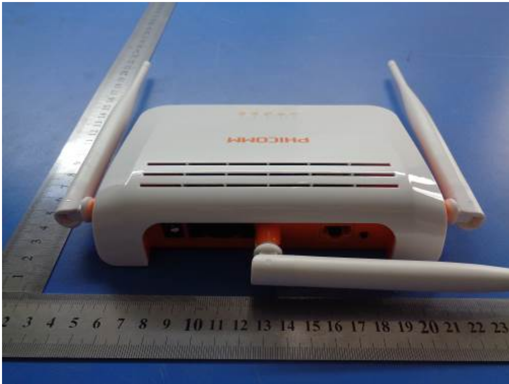
EUT – Top View

Report No.: 14050025-FCC-E Issue Date: June 09, 2014 Page: 24 of 35 www.siemic.com.cn