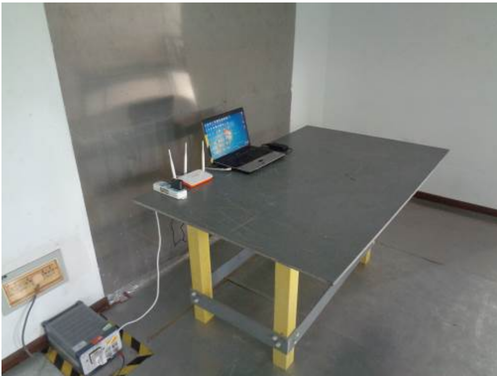
Conducted Emissions Test Setup – Side View