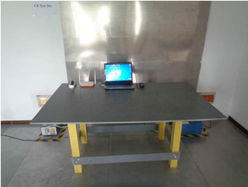
Conducted Emissions Test Setup – Front View