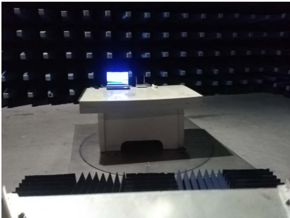
Radiated Emissions Test Setup Above 1GHz--Adapter: PSAA06A-120