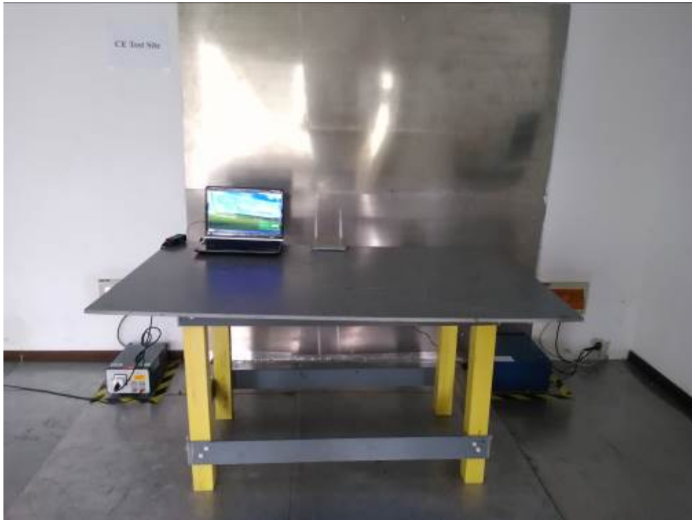
Conducted Emissions Test Setup Front View-Adapter: RD1200500-C55-8MG