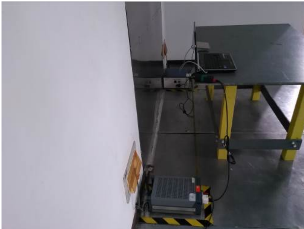
Conducted Emissions Test Setup Side View-Adapter: RD1200500-C55-8MG