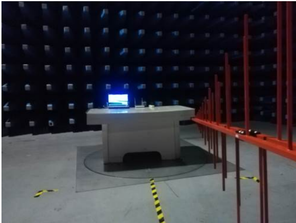
Radiated Emissions Test Setup Below 1GHz - -Adapter: RD1200500-C55-8MG

Report No.: 14050049-FCC-E Issue Date: July 14, 2014 Page: 32 of 39 www.siemic.com.cn