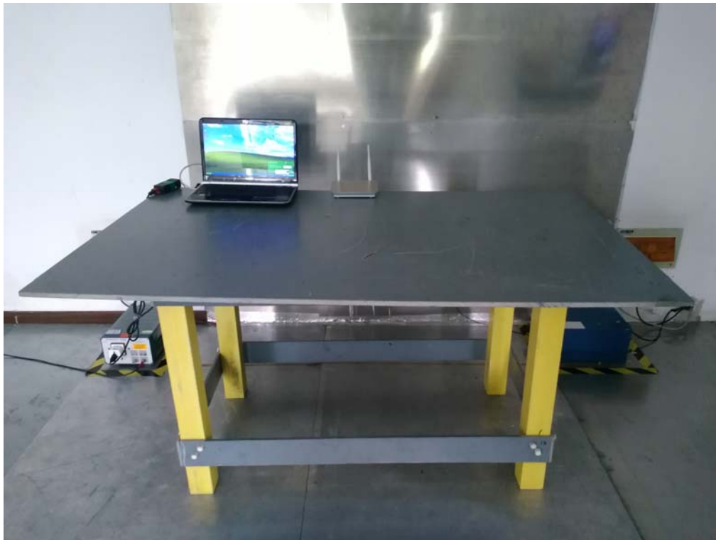
Conducted Emissions Test Setup Front View-Adapter: PSAA06A-120

Report No.: 14050049-FCC-E Issue Date: July 14, 2014 Page: 31 of 39 www.siemic.com.cn