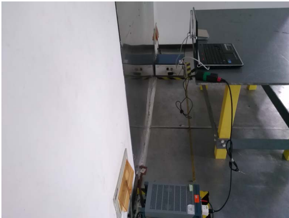
Conducted Emissions Test Setup Side View-Adapter: PSAA06A-120