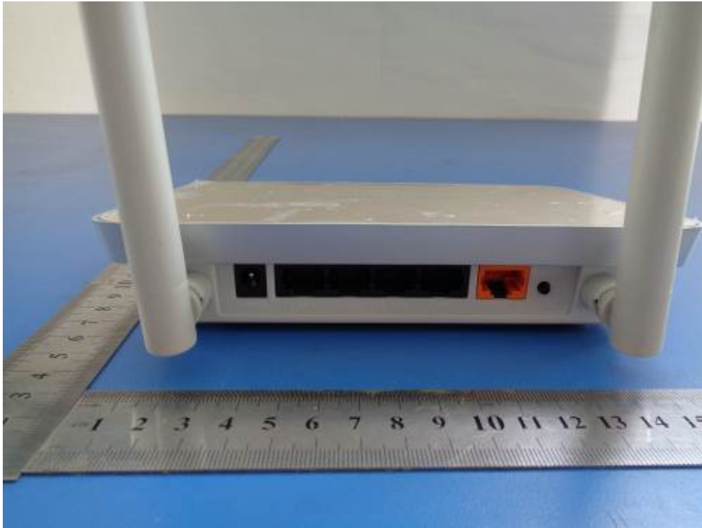
EUT – Top View

Report No.: 14050049-FCC-E Issue Date: July 14, 2014 Page: 25 of 37 www.siemic.com.cn