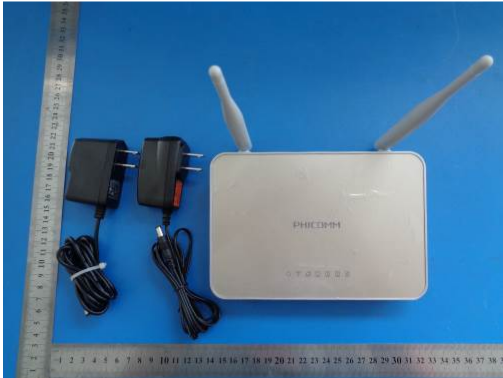
All Packages – Front View