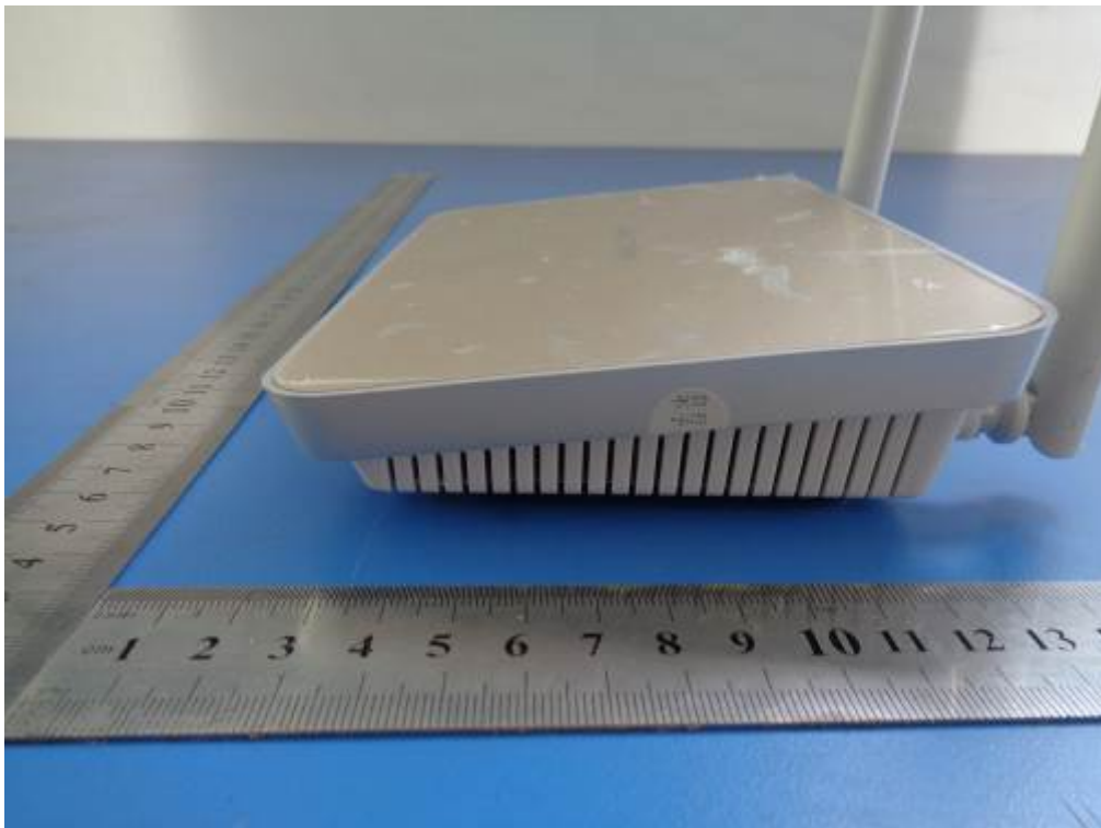
EUT – Right View