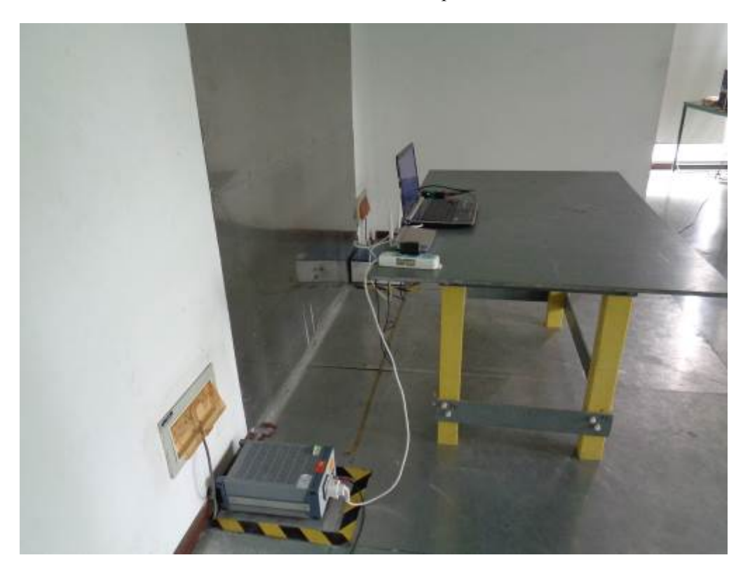
Conducted Emissions Test Setup – Side View