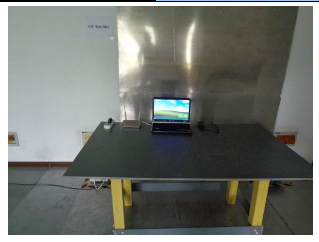
Conducted Emissions Test Setup – Front View