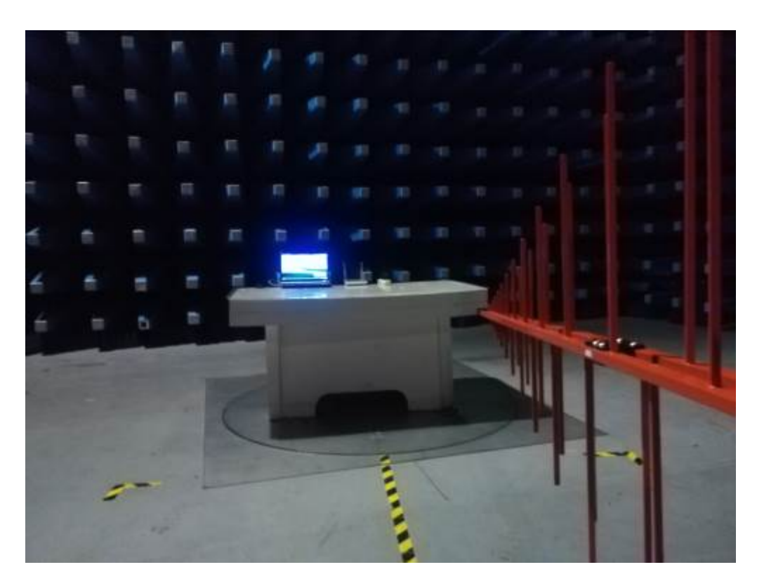
Radiated Spurious Emissions Test Setup Below 1GHz - Front View

Report No.: 14050049-FCC-R1 Issue Date: July 14, 2014 Page: 37 of 43 www.siemic.com.cn