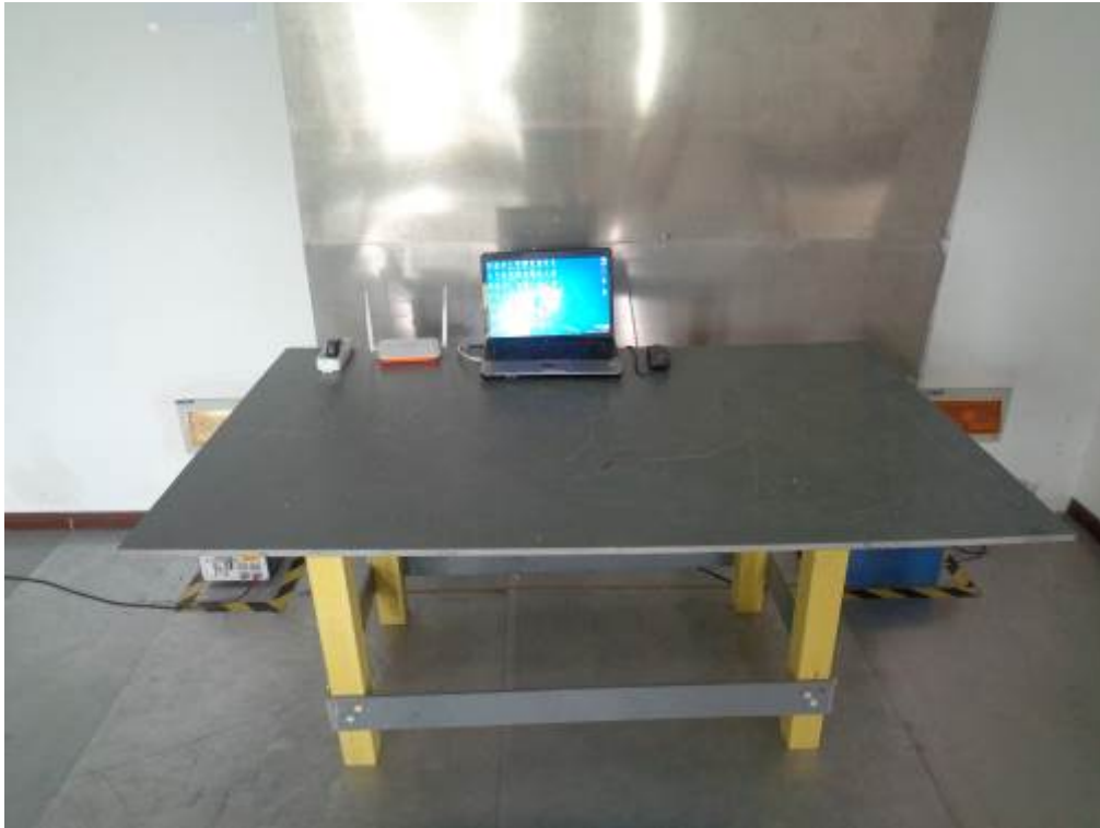
Conducted Emissions Test Setup – Front View