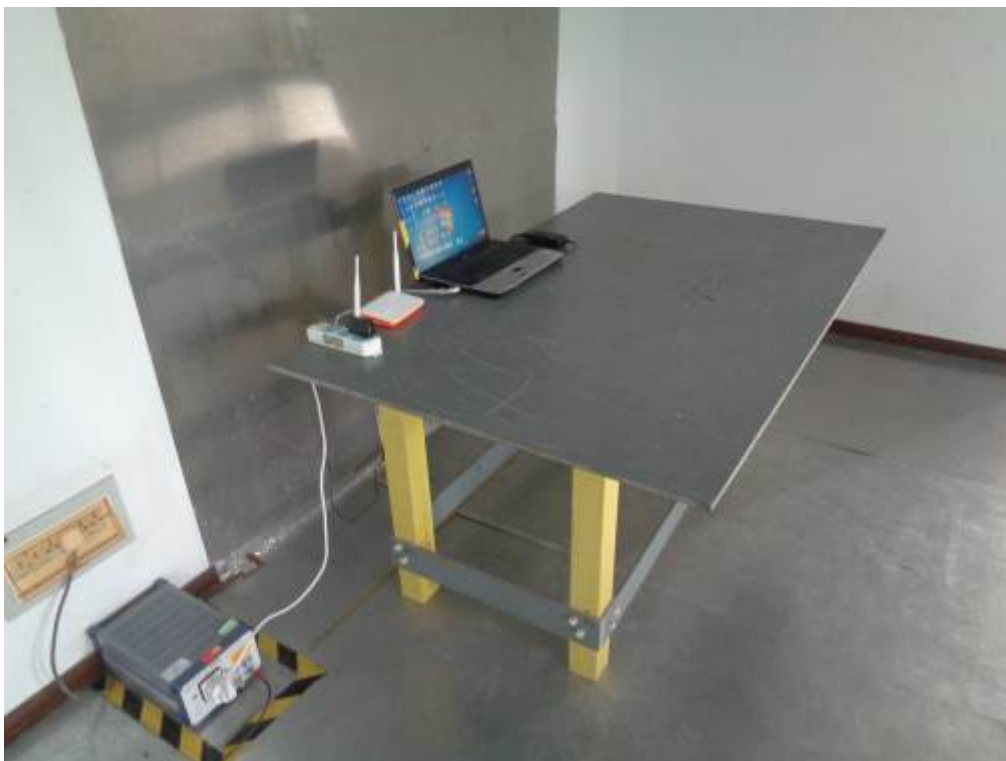
Conducted Emissions Test Setup – Side View