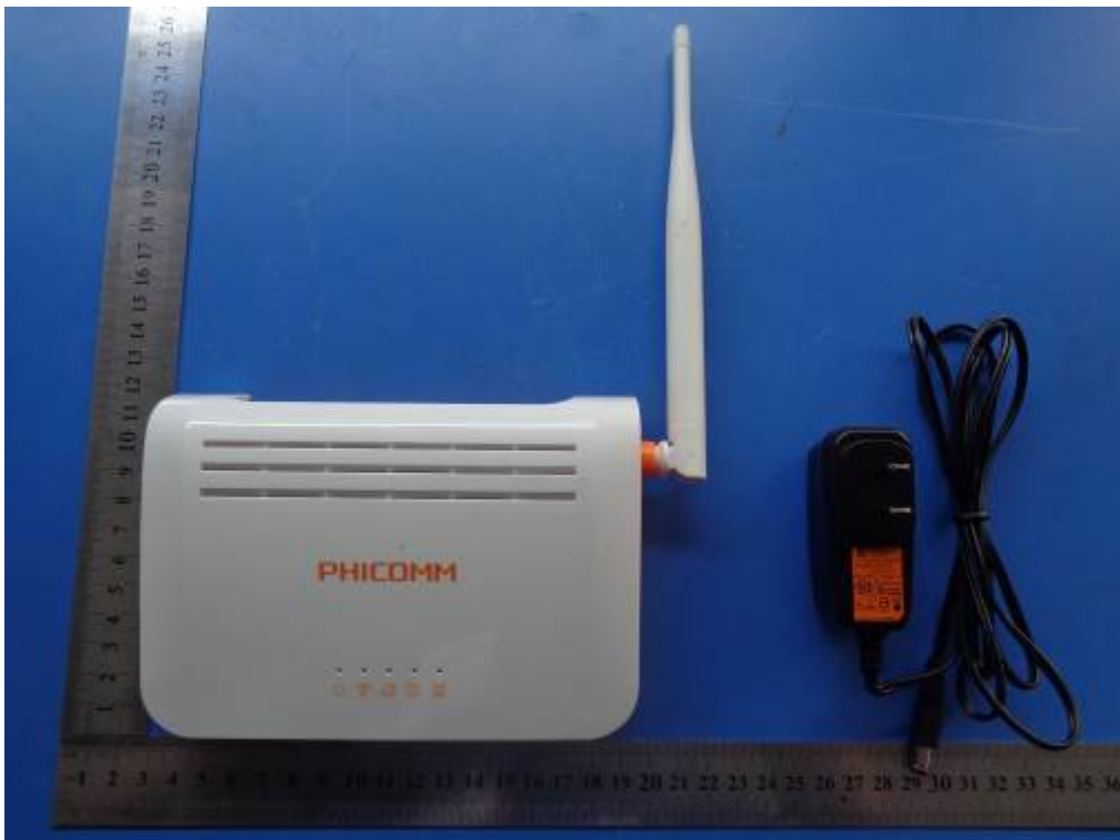
All Packages – Front View