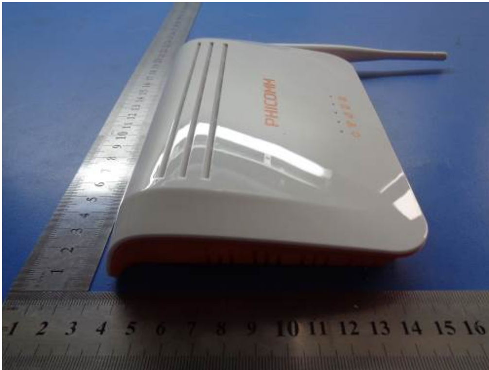
EUT – Left View

Report No.: 14050023-FCC-E Issue Date: June 09, 2014 Page: 25 of 35 www.siemic.com.cn