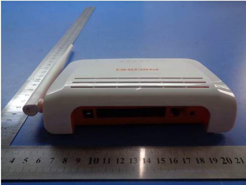
EUT – Top View

Report No.: 14050023-FCC-E Issue Date: June 09, 2014 Page: 24 of 35 www.siemic.com.cn