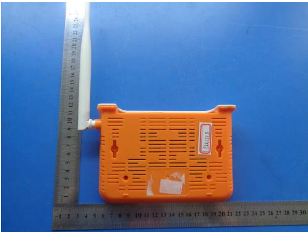
EUT - Rear View