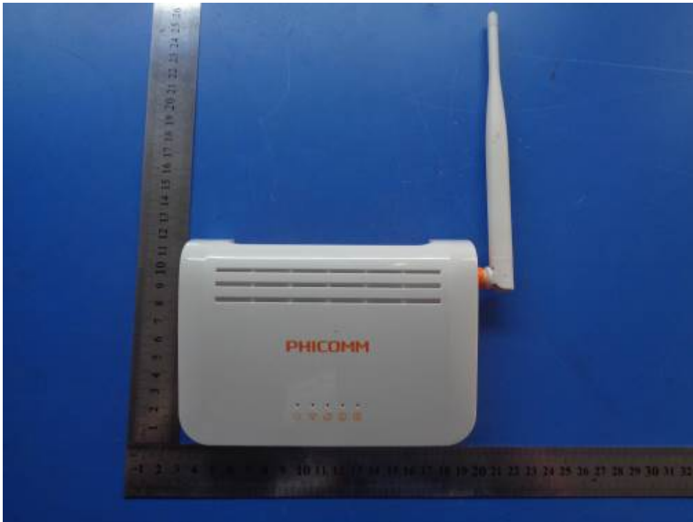
EUT - Front View

Report No.: 14050023-FCC-E Issue Date: June 09, 2014 Page: 23 of 35 www.siemic.com.cn