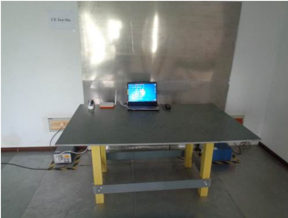
Conducted Emissions Test Setup – Front View