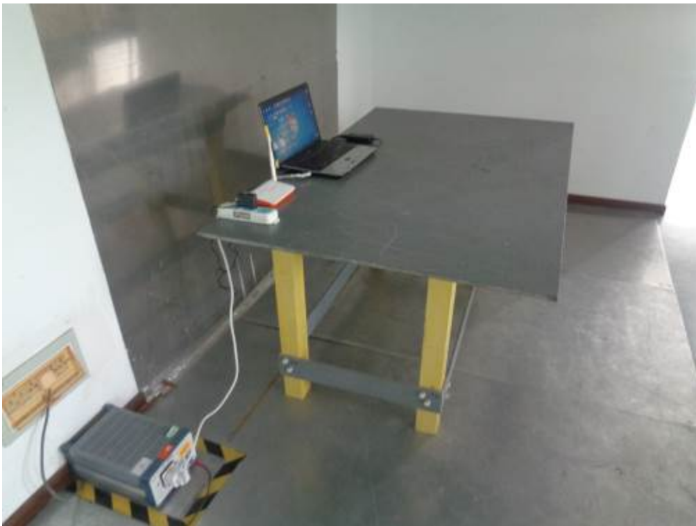
Conducted Emissions Test Setup – Side View