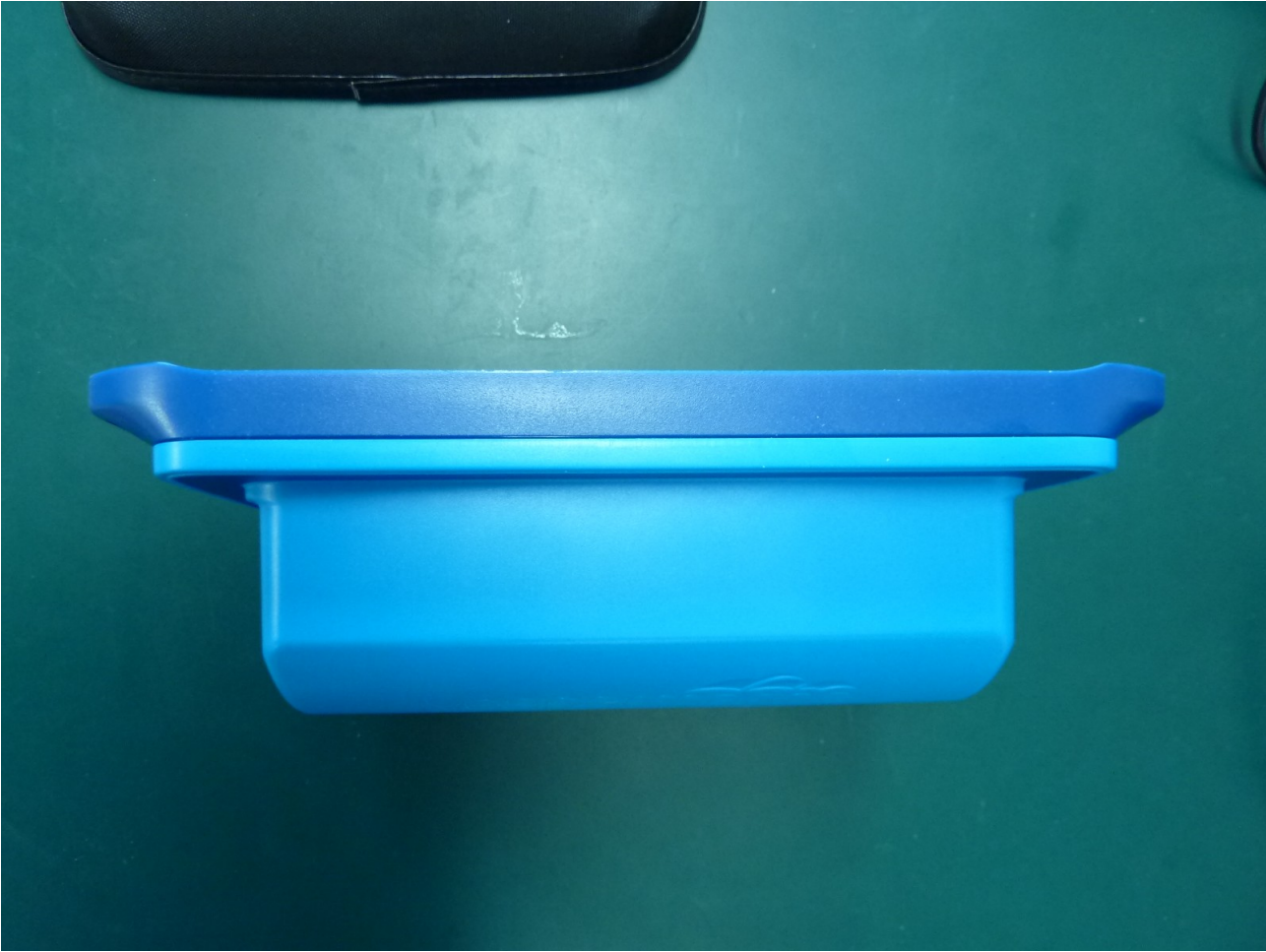
XB-8000 / XB-6000 – Top View