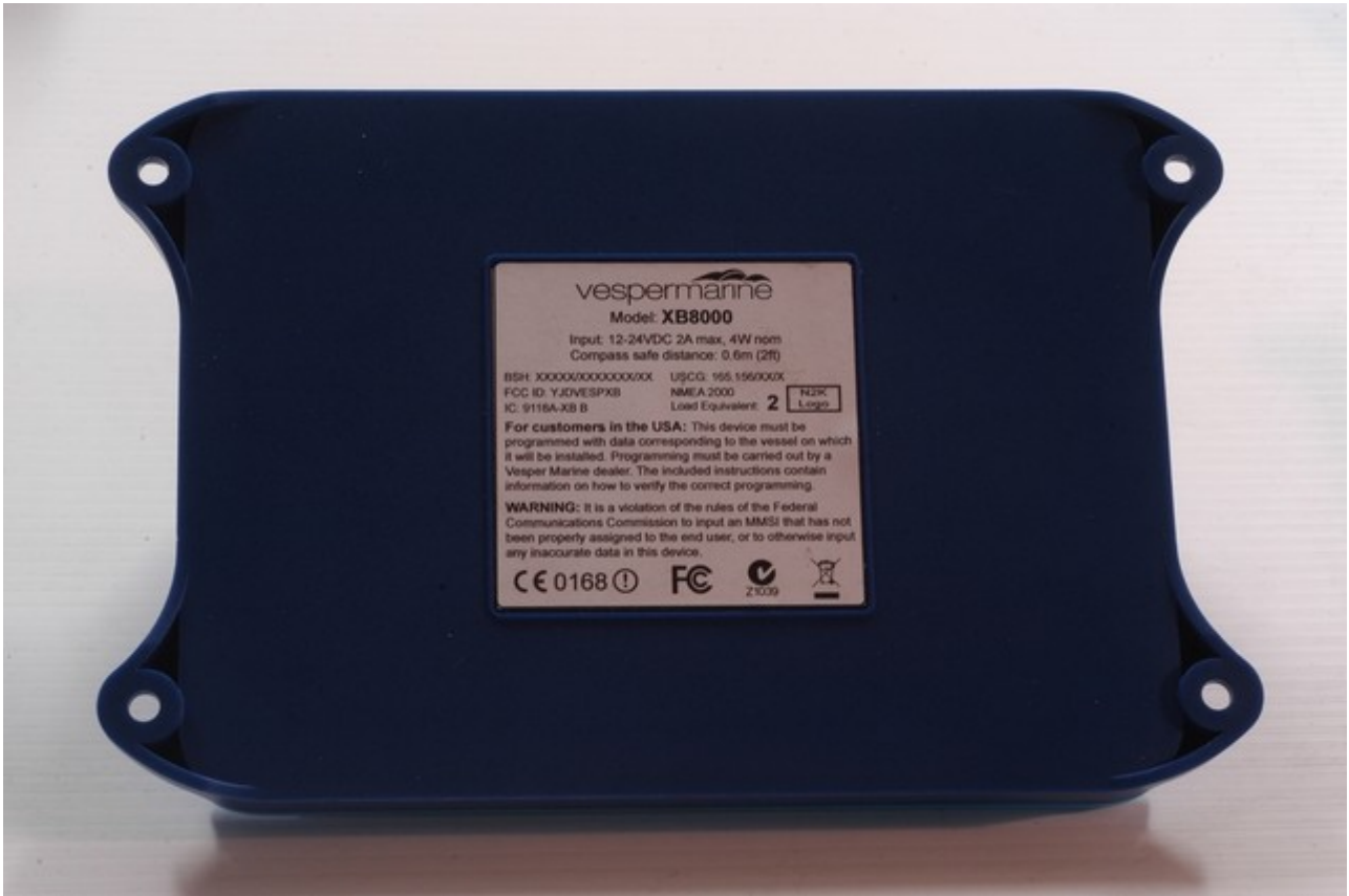
XB-8000 / XB-6000 – Rear View