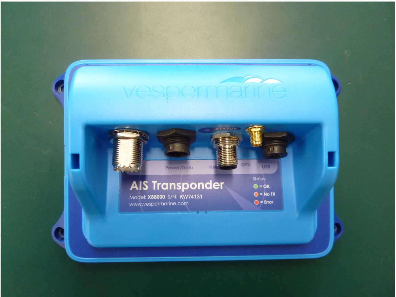
XB-8000 / XB-6000 – Front View