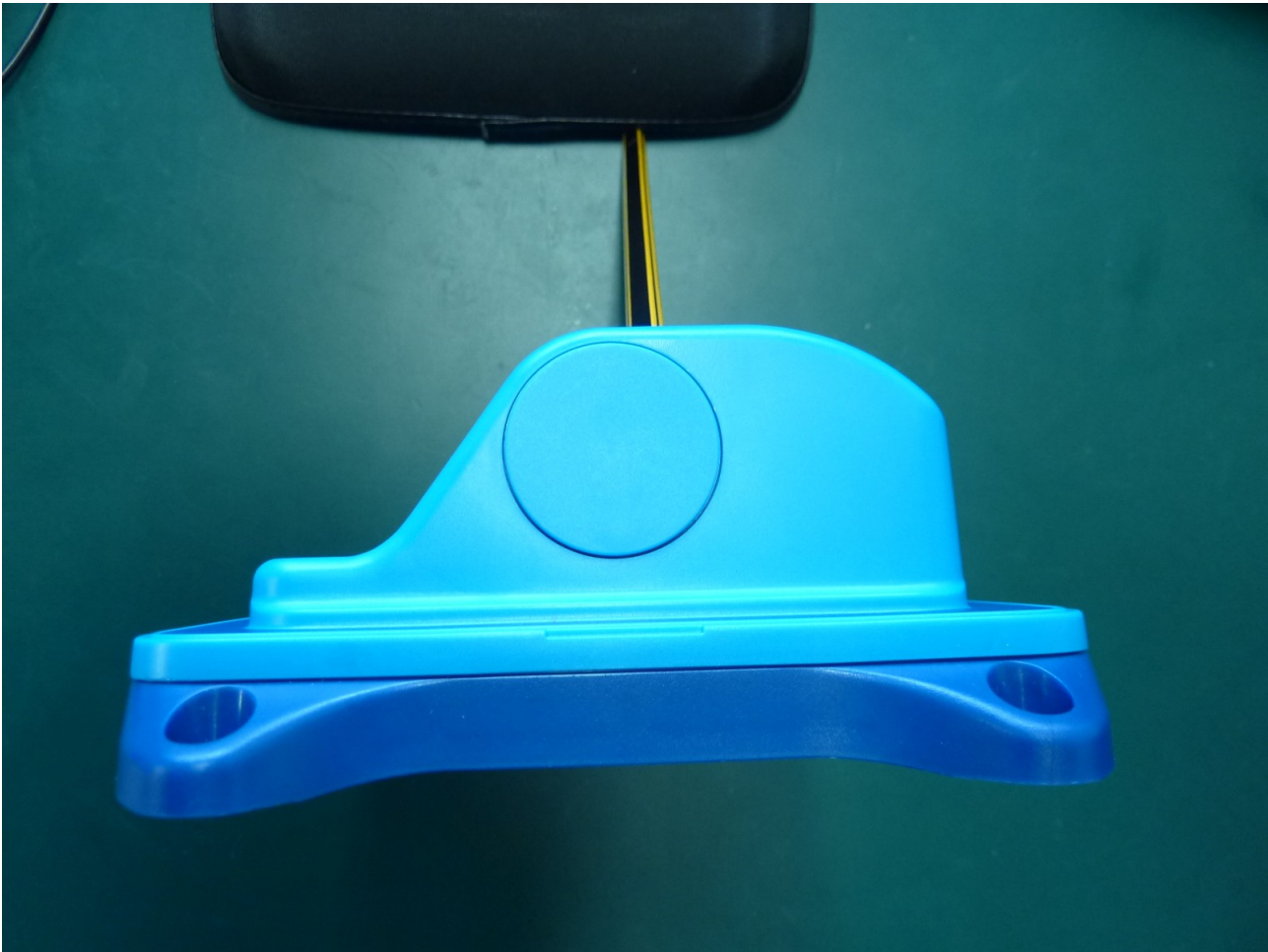
XB-8000 / XB-6000 – Side 1 View