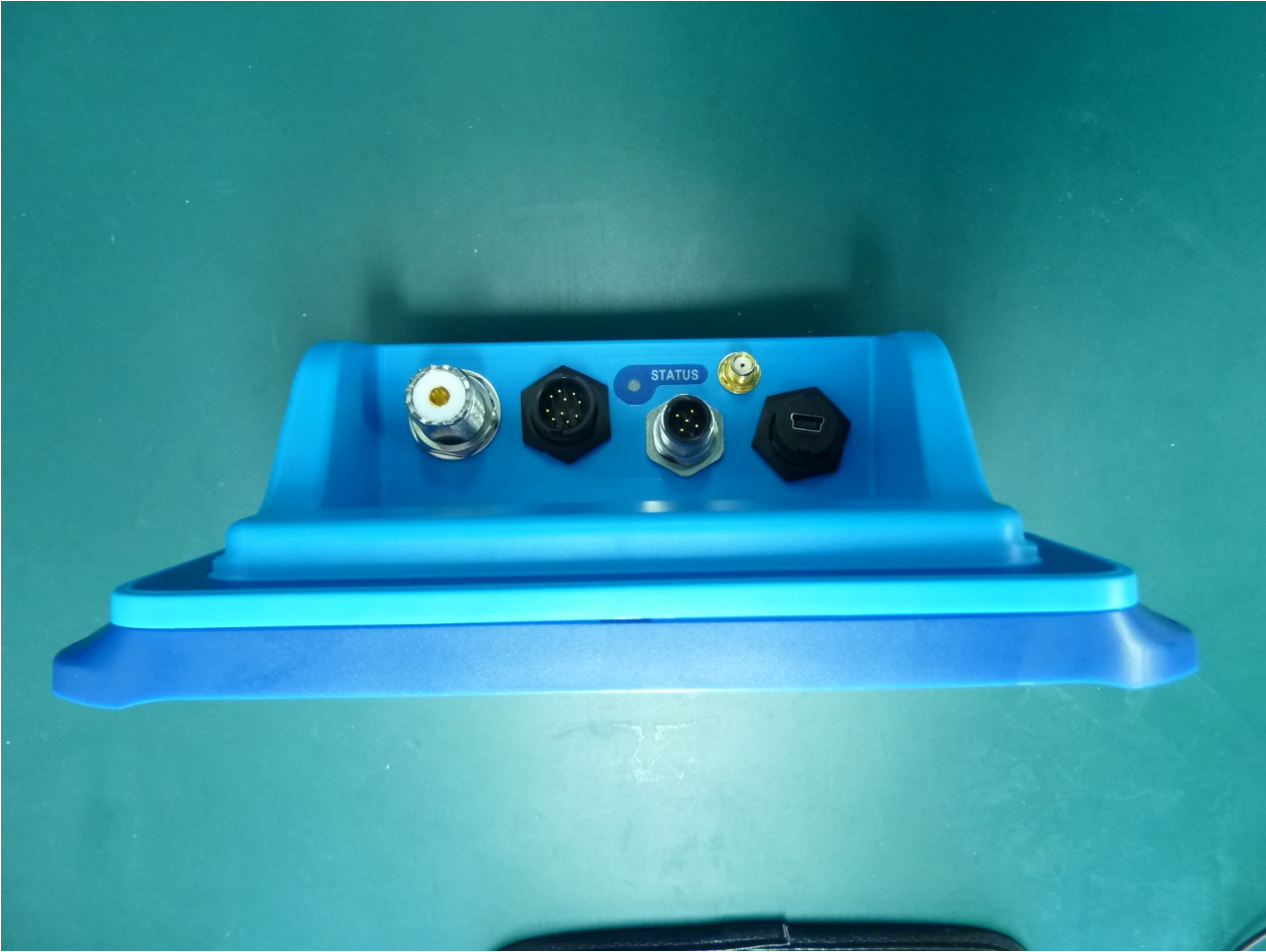
XB-8000 / XB-6000 – Bottom View