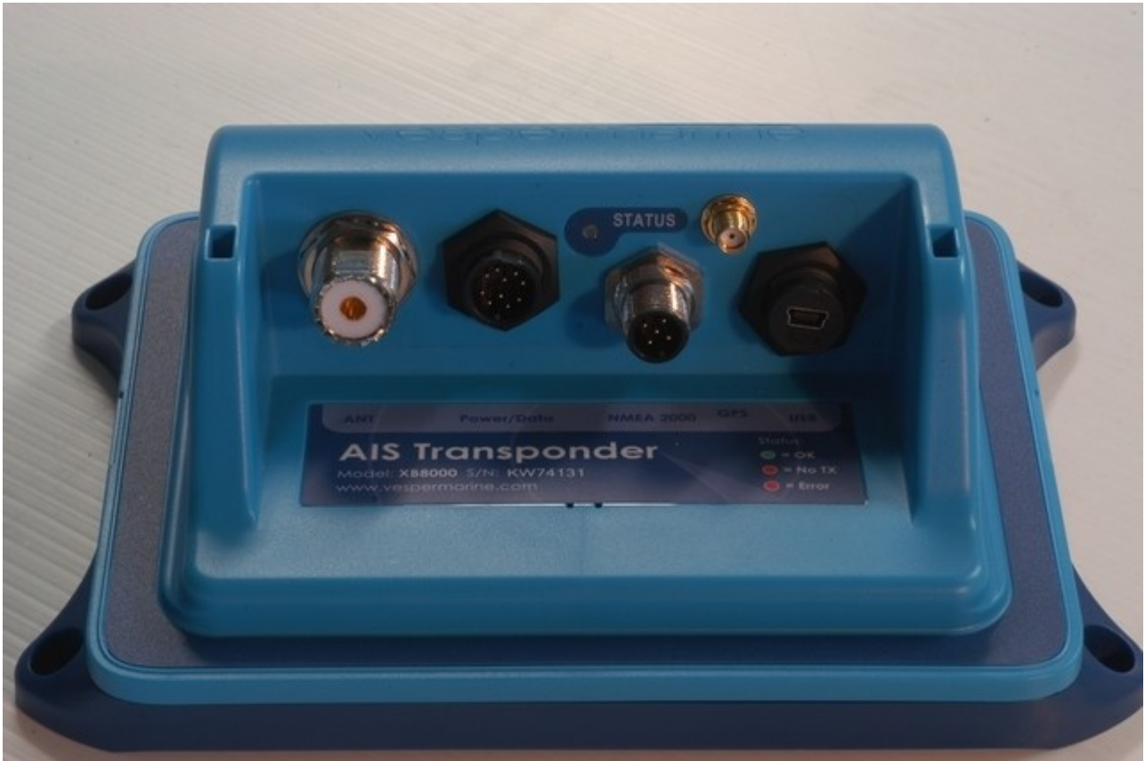
XB-8000 / XB-6000 – Connector View