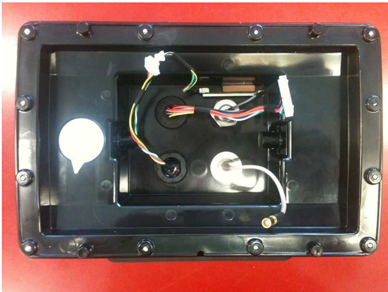
WMX850 – Rear assembly