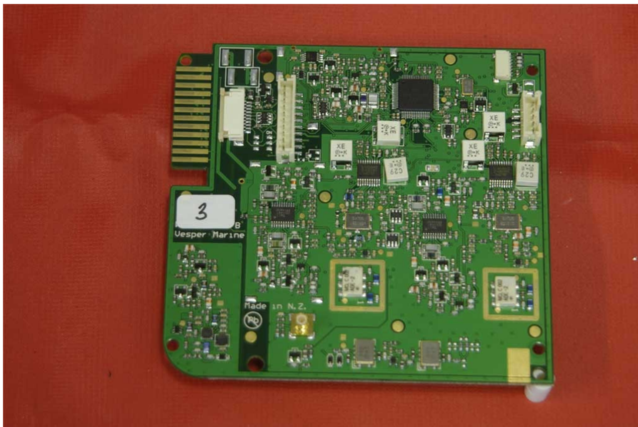
Main PCB – Top