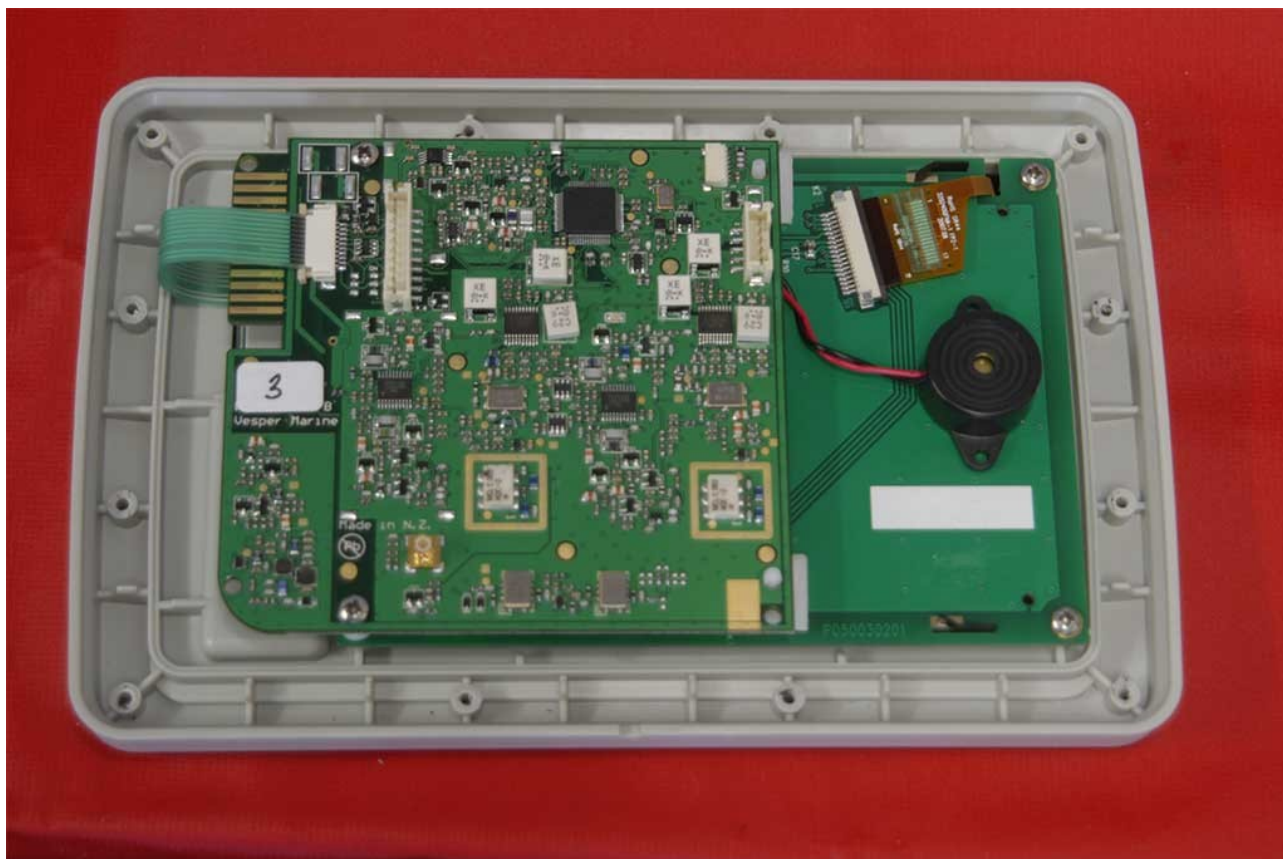
WMX850 – Front assembly