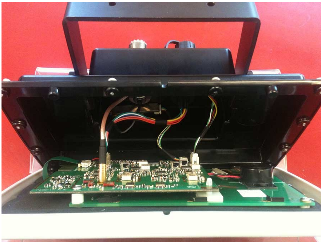
WMX850 – Enclosure open showing connectors in place