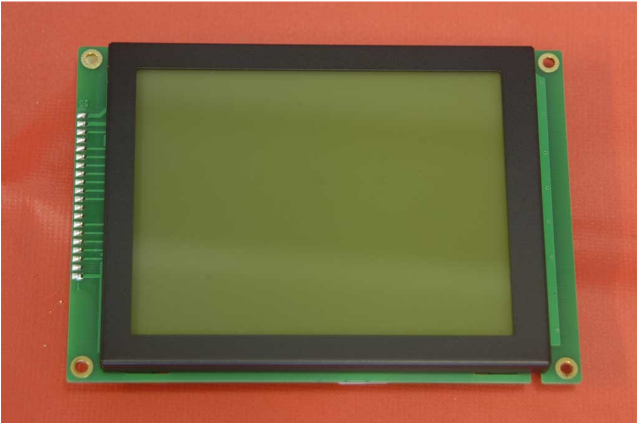
LCD PCB – Bottom