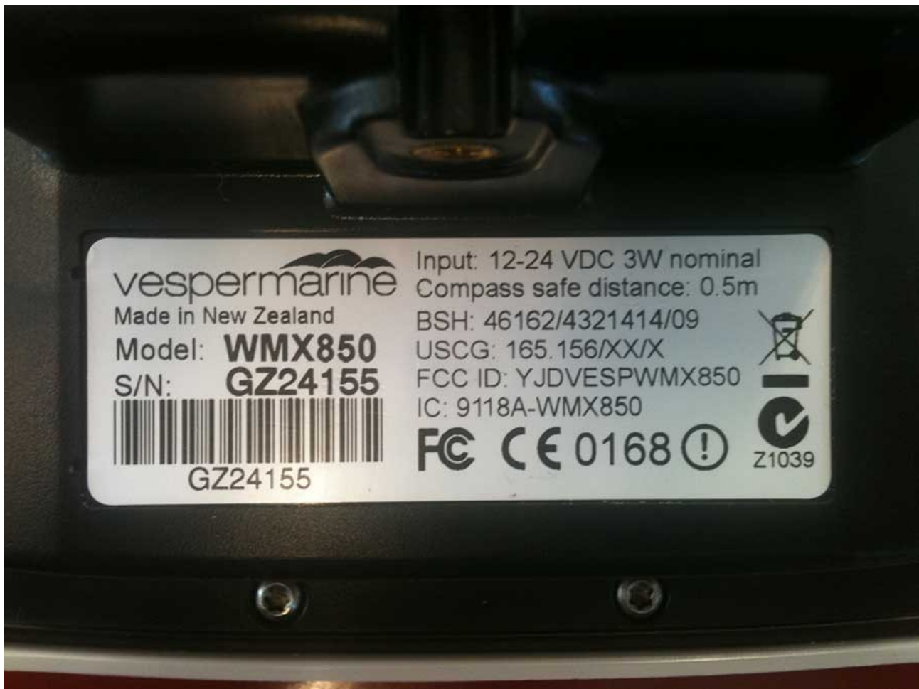
WMX850 – Serial Label Example