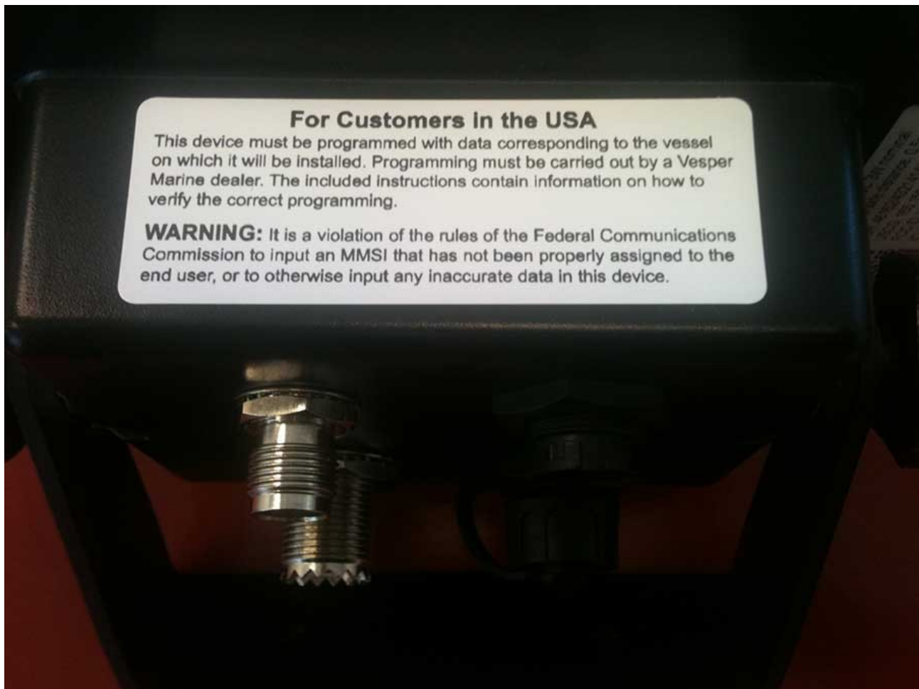
WMX850 – USA Customer Warning Label