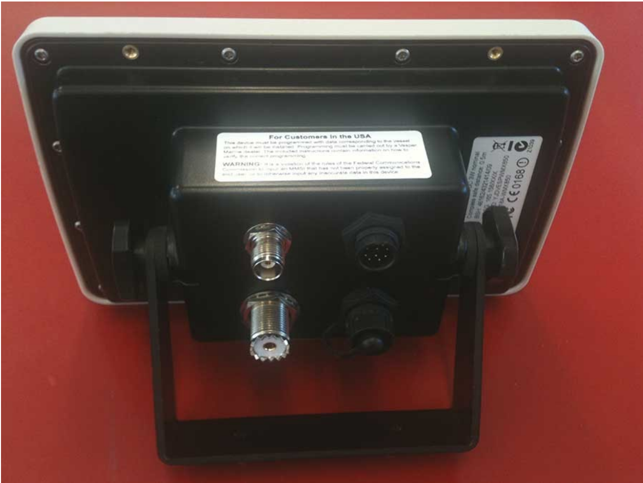
WMX850 – Label Locations