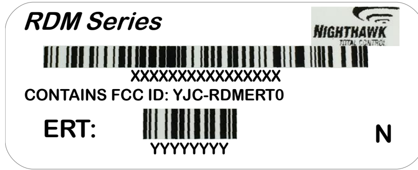
Figure 3. Host Meter Label.

The host meter will contain a label such as the one shown in Figure 3. The label will be placed on the outside of the host meter at the location shown in Figure 4.