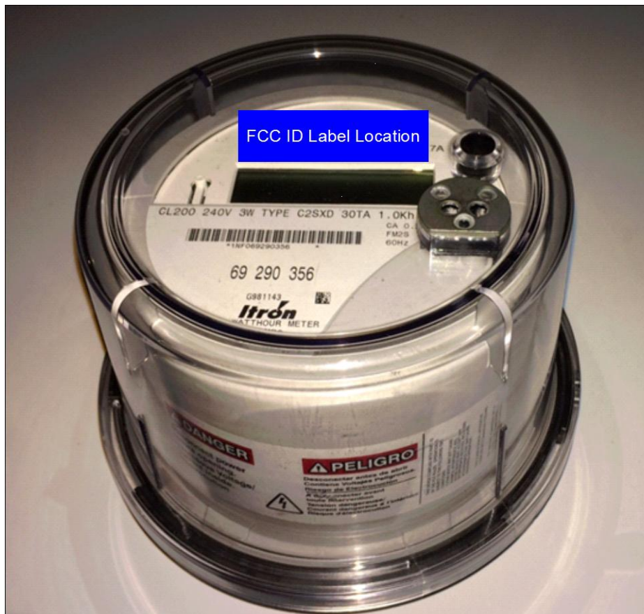
Figure 4. Host Meter Label Location.