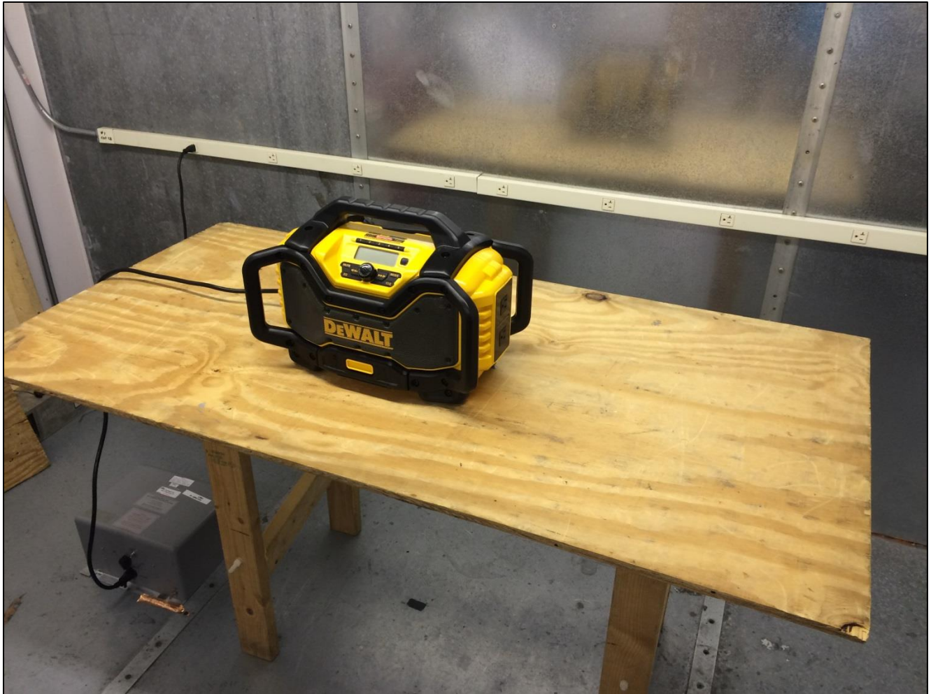
Photograph 1. Conducted Emissions, 15.207(a), Test Setup