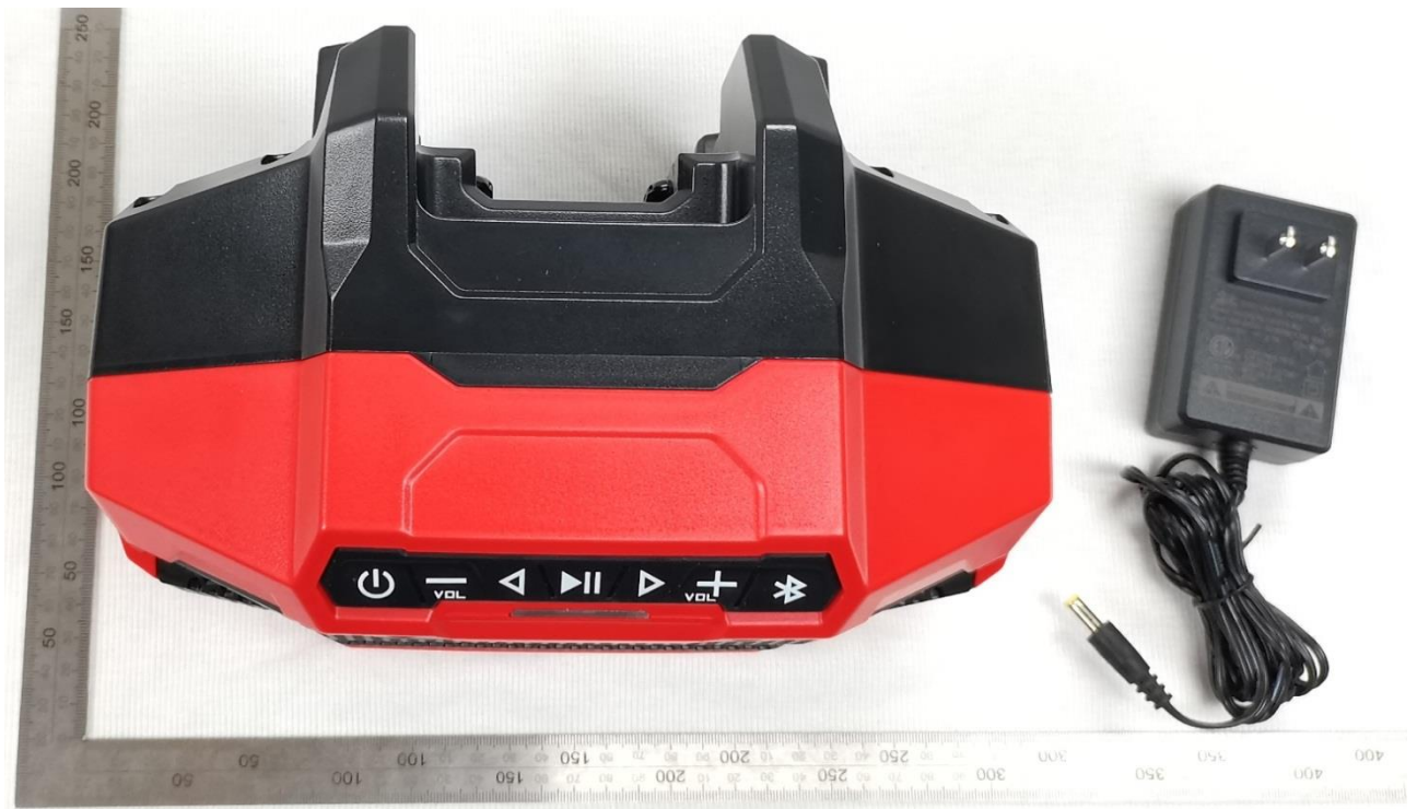
CMC001, top view