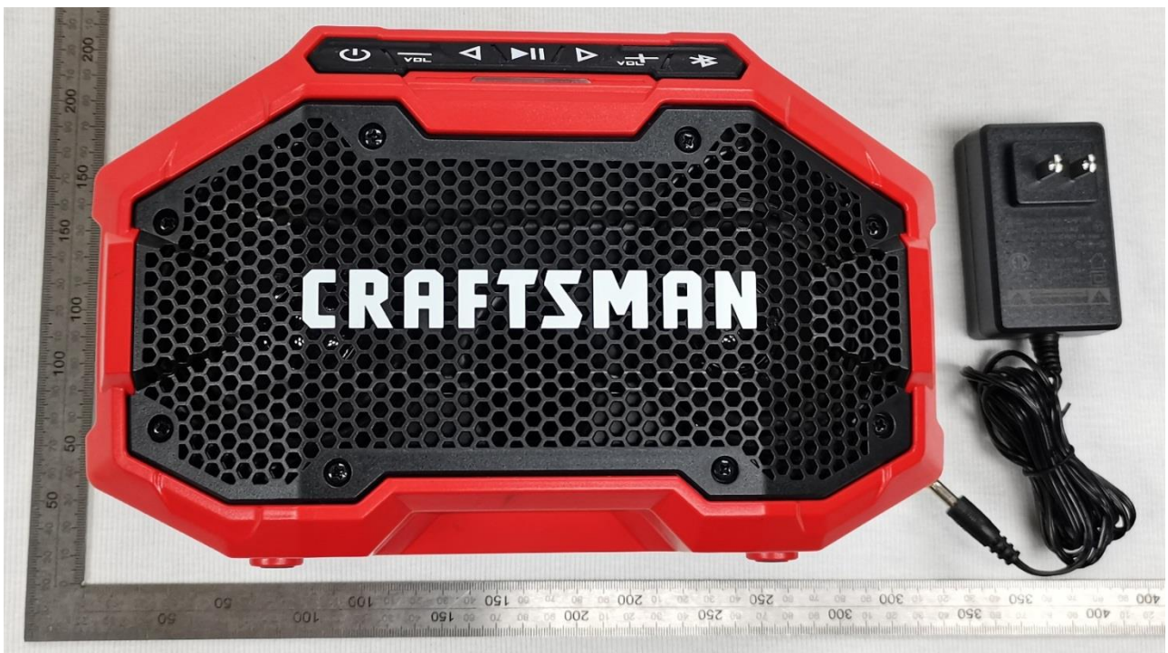
CMCR001, front view