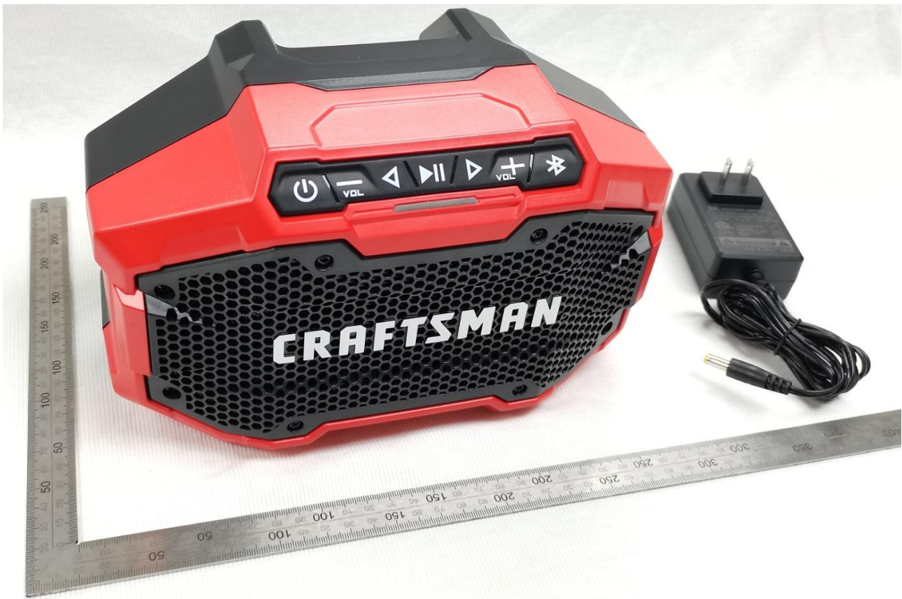
CMCR001, whole view