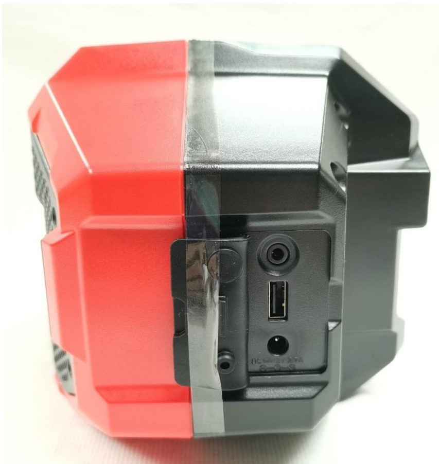
Right view, with an AUDIO IN jack ( \phi 3.5 mm stereo mini jack), and a USB type-A connector (for output charging only), and a DC IN jack.