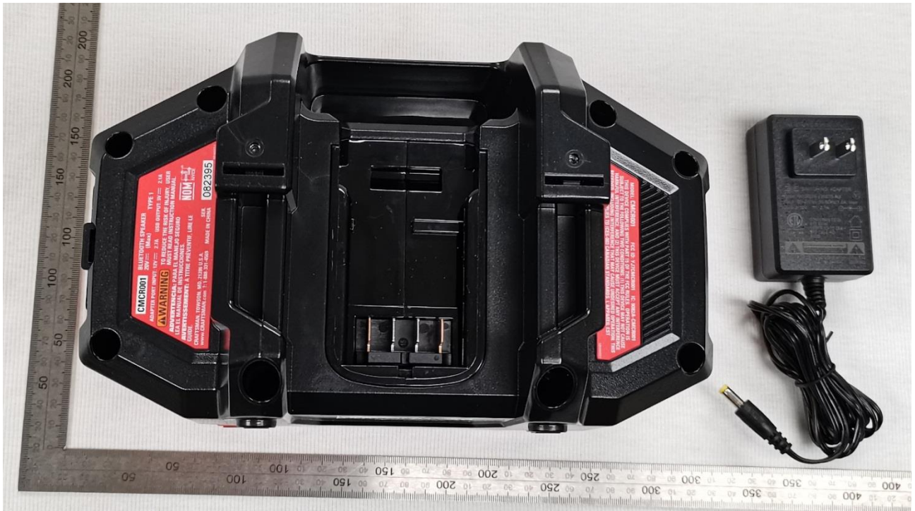
CMC001, back view (with name plate & FCC/IC label)