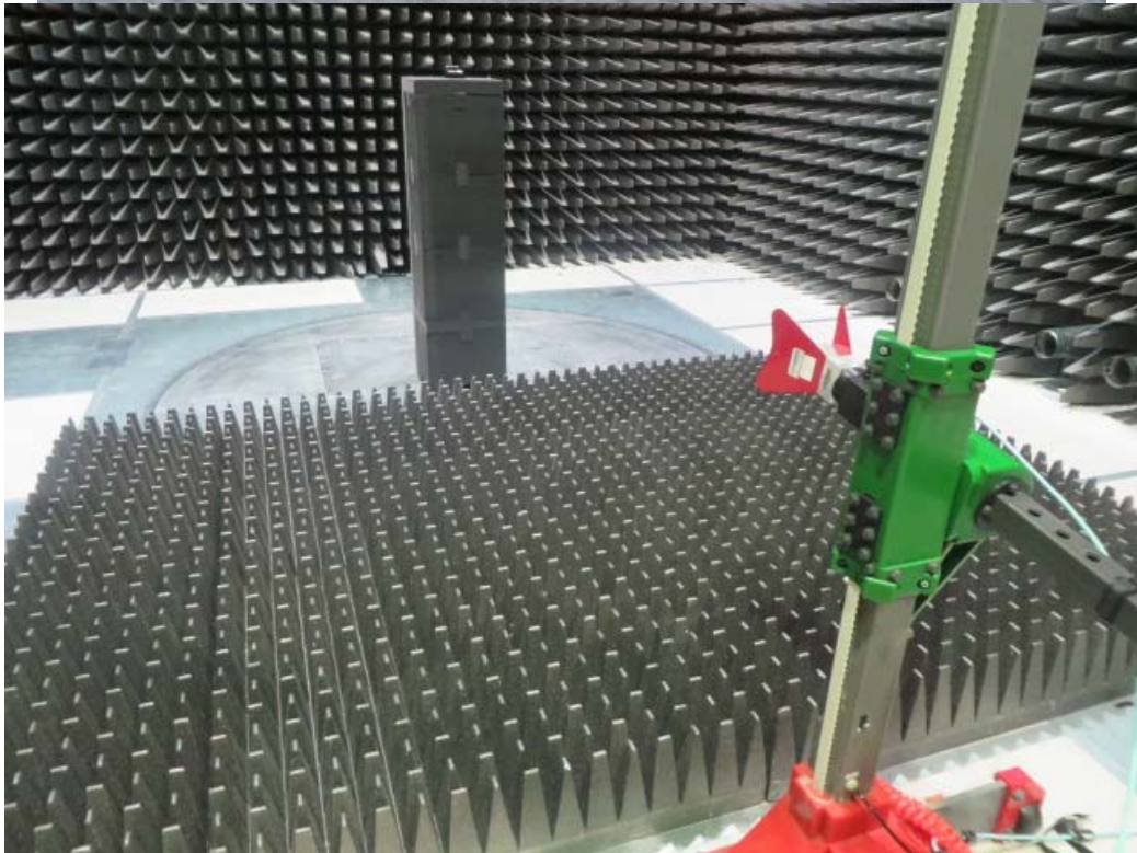
Radiated above 1 GHz