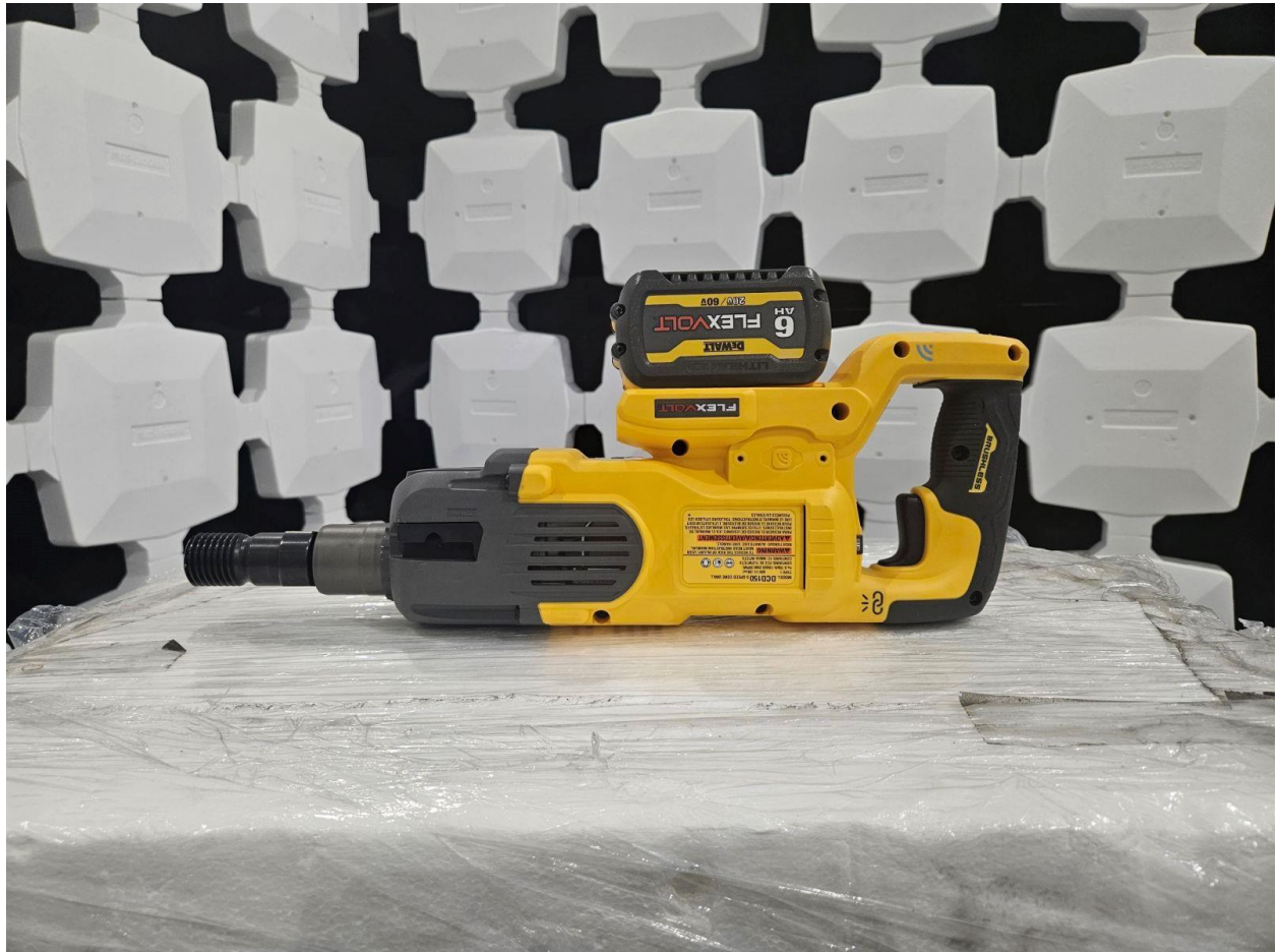
Radiated Emissions, handheld portion Evaluation, > 1GHz View 1