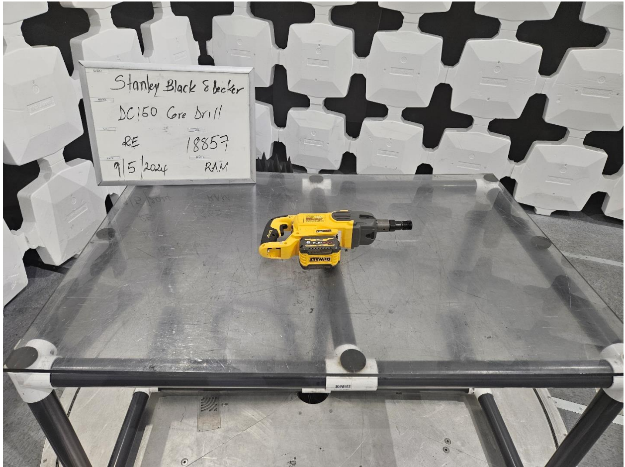
Radiated Emissions, table-top evaluation, < 1GHz View 1