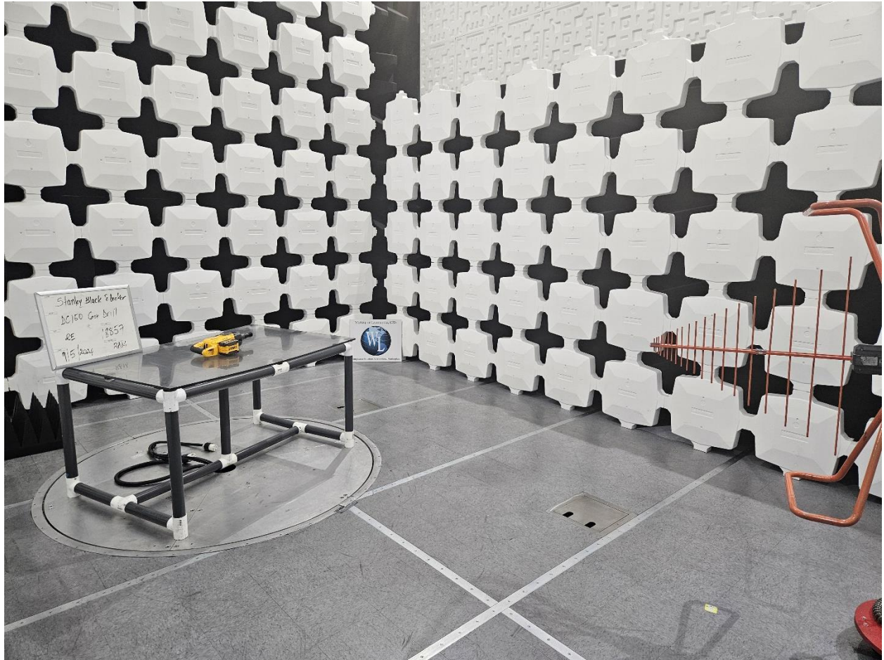
Radiated Emissions, table-top evaluation, < 1GHz View 2