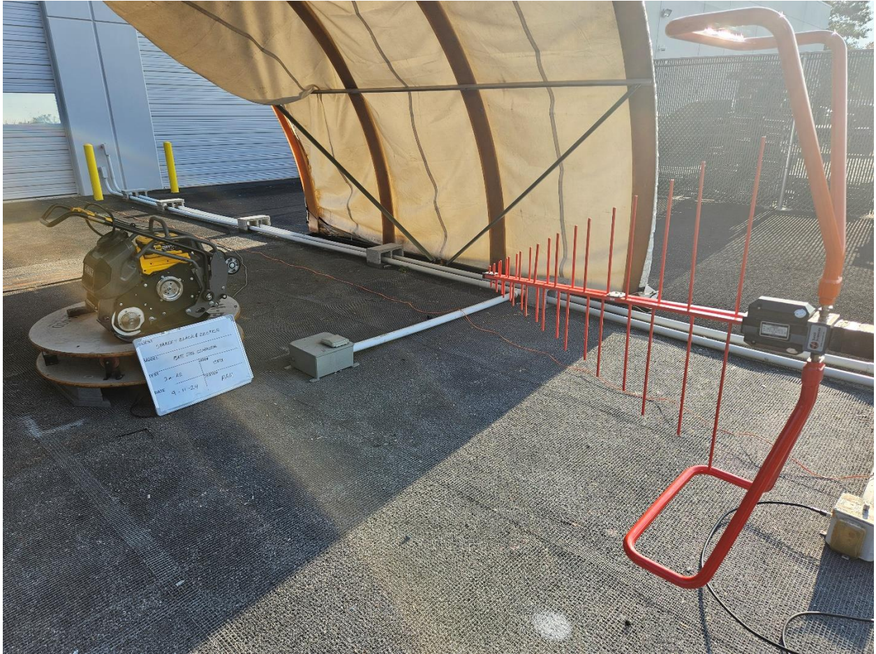
Radiated Emissions, table-top evaluation, < 1GHz View 2