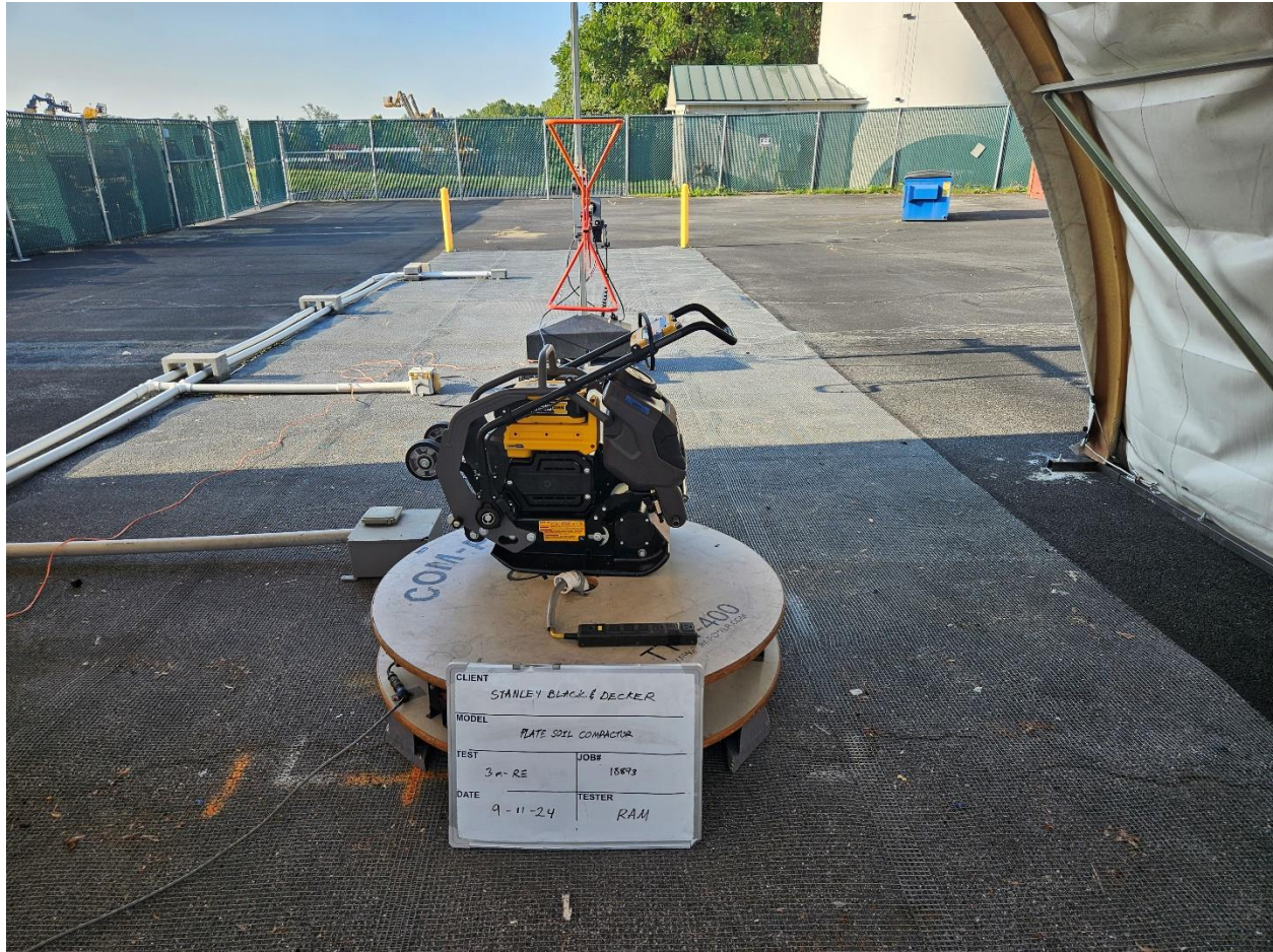
Radiated Emissions, table-top evaluation, < 1GHz View 1