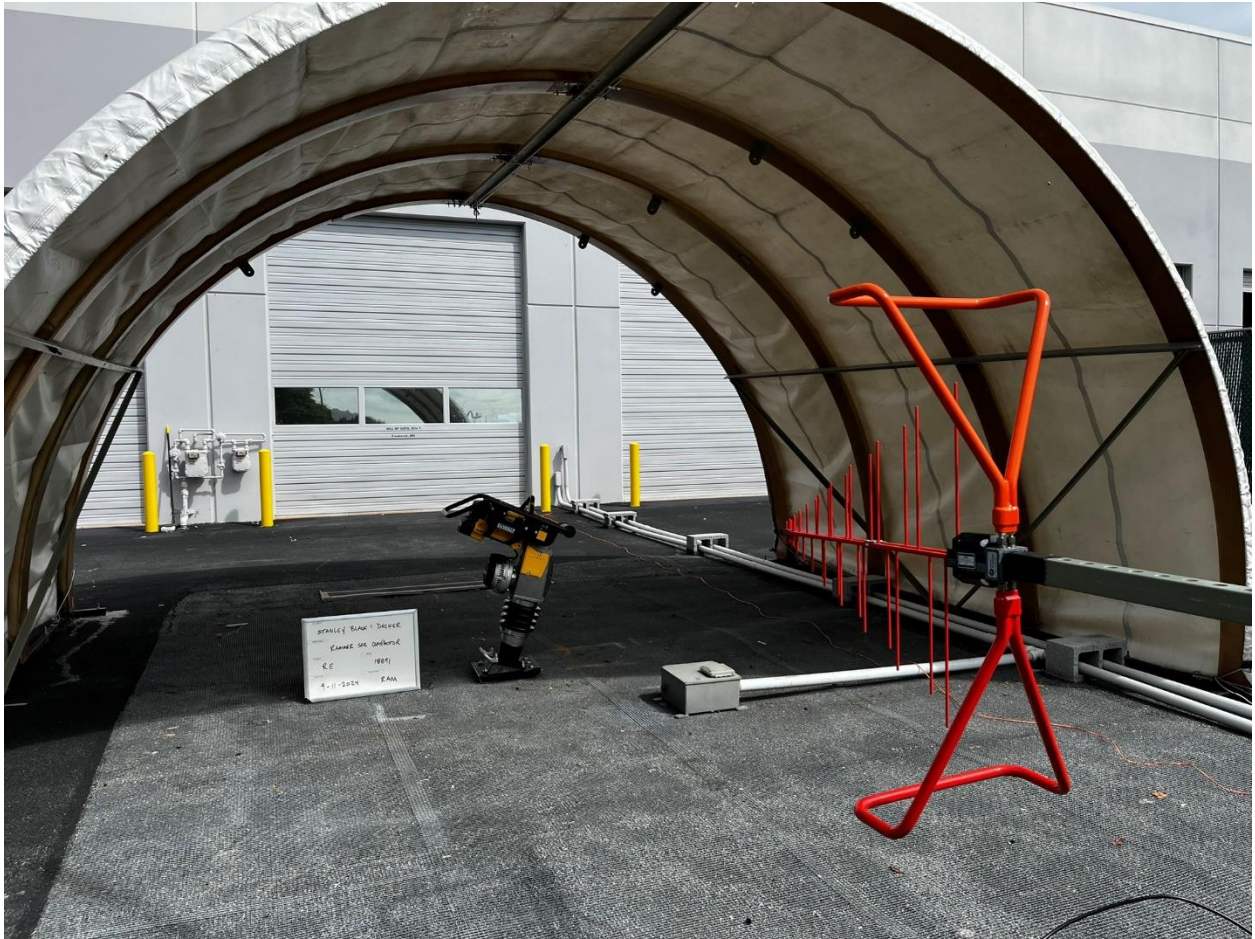
Radiated Emissions View 3, <1GHz