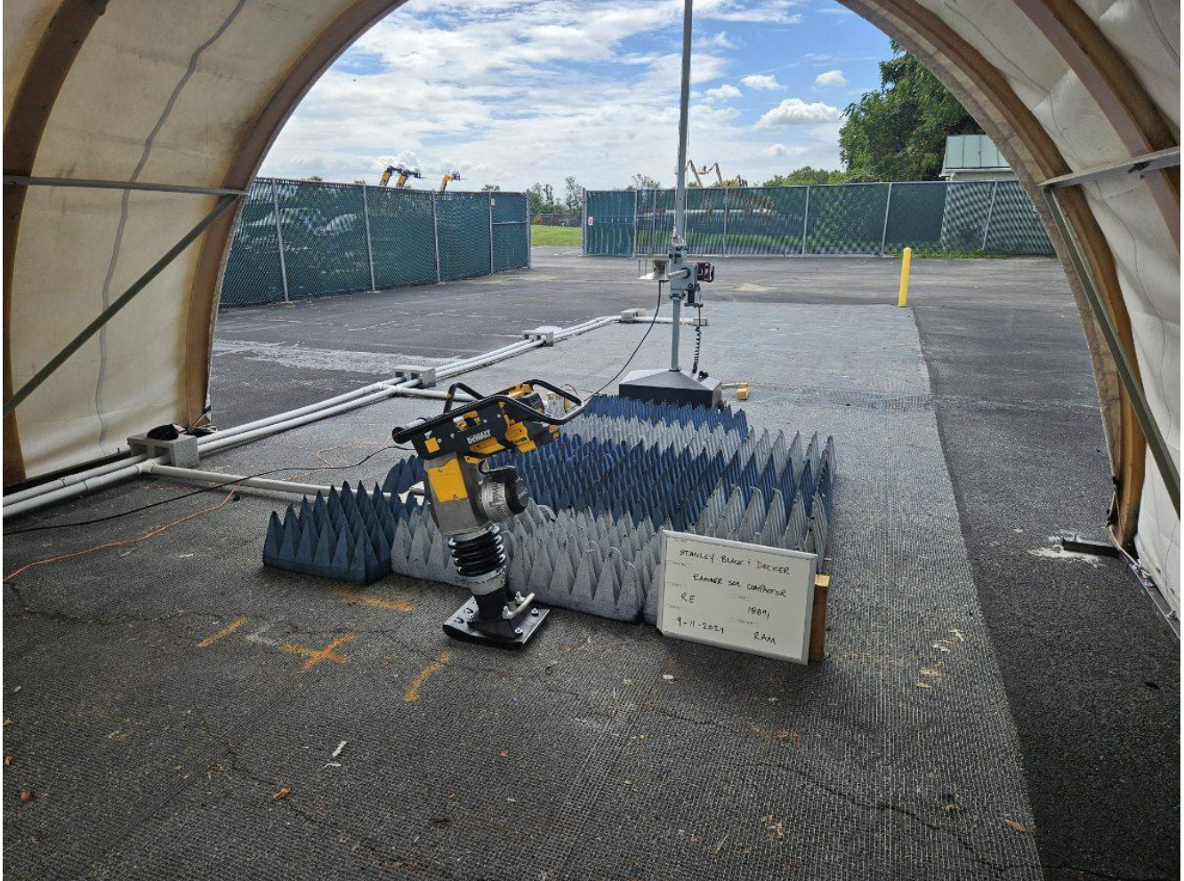
Radiated Emissions View 5, >1GHz