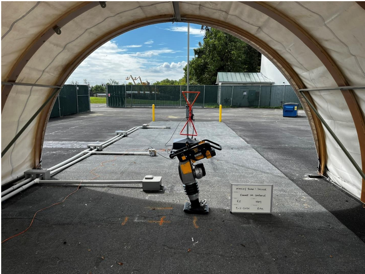
Radiated Emissions View 1, <1GHz