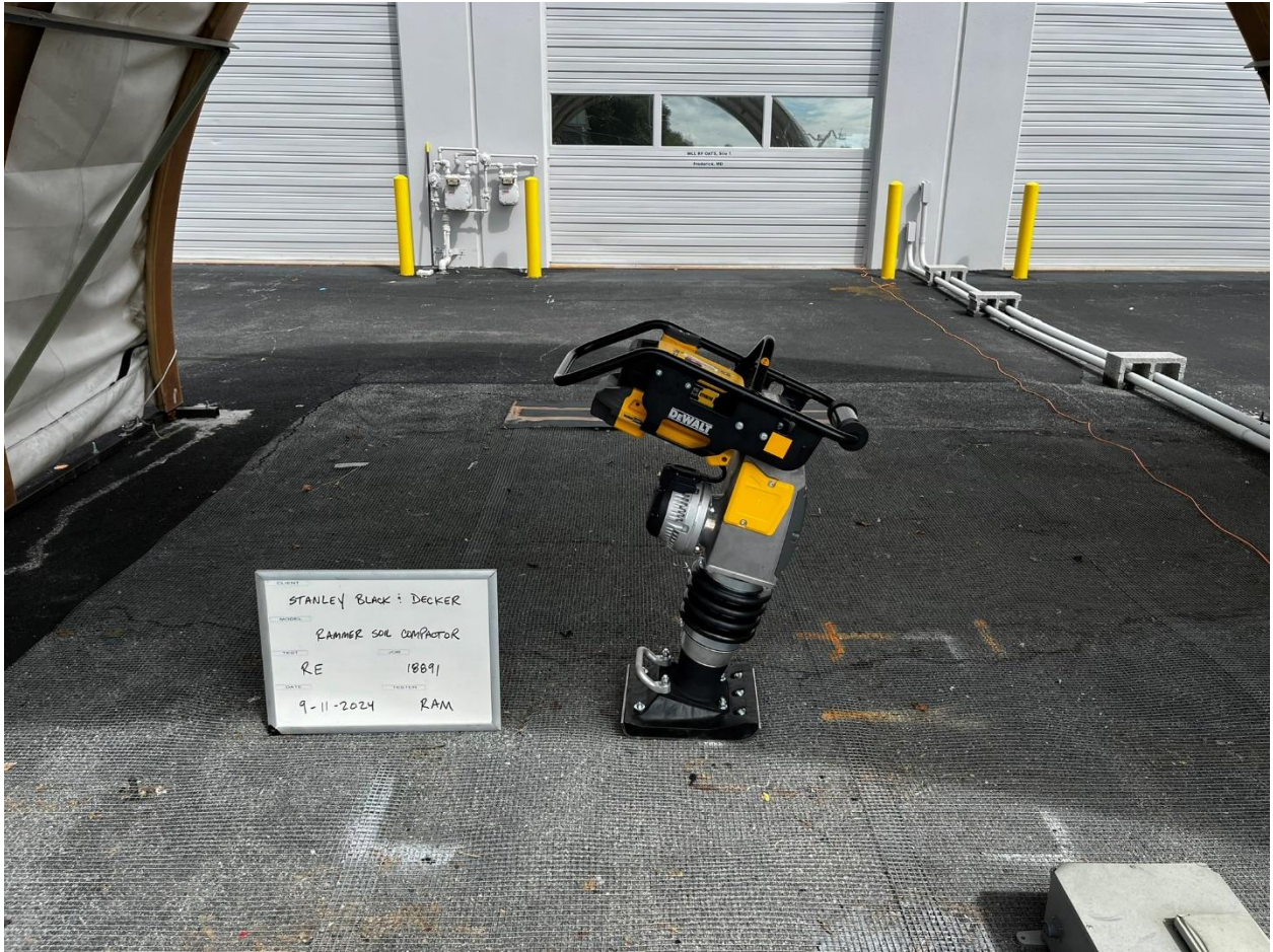
Radiated Emissions View 2, <1GHz