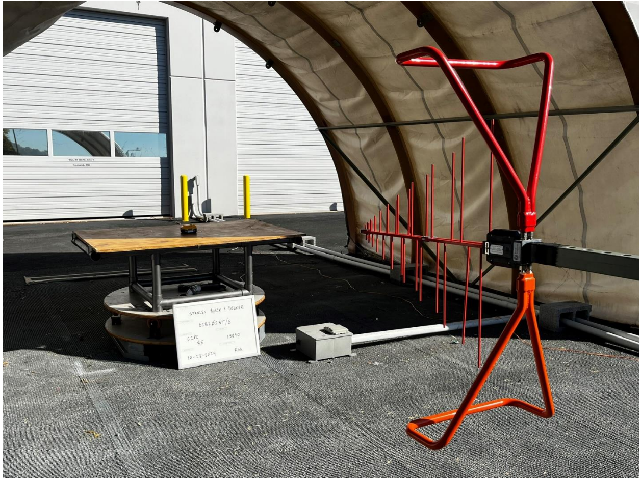
Radiated Emissions View 3, <1GHz