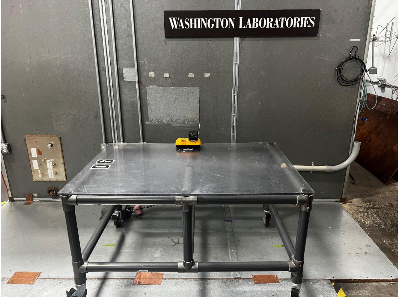
AC Powerline Emissions Front View