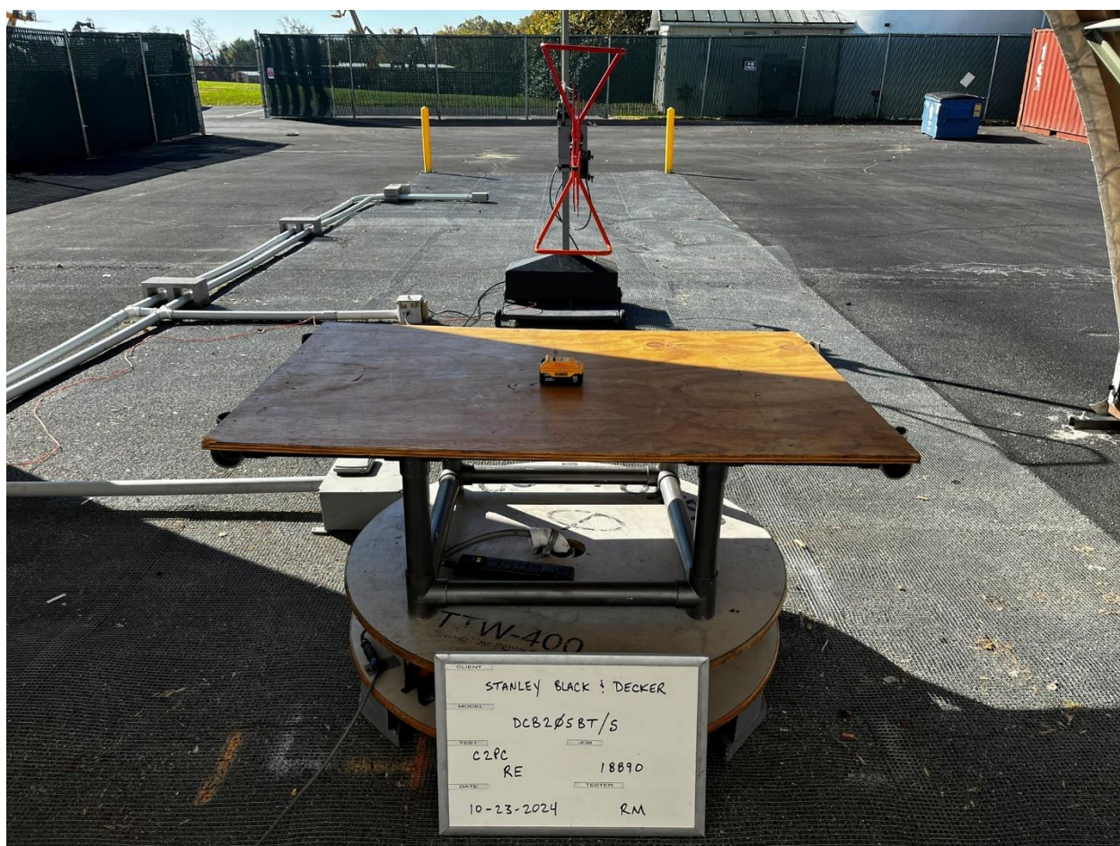
Radiated Emissions View 1, <1GHz