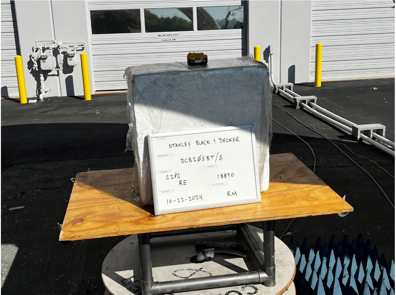
Radiated Emissions View 4, >1GHz