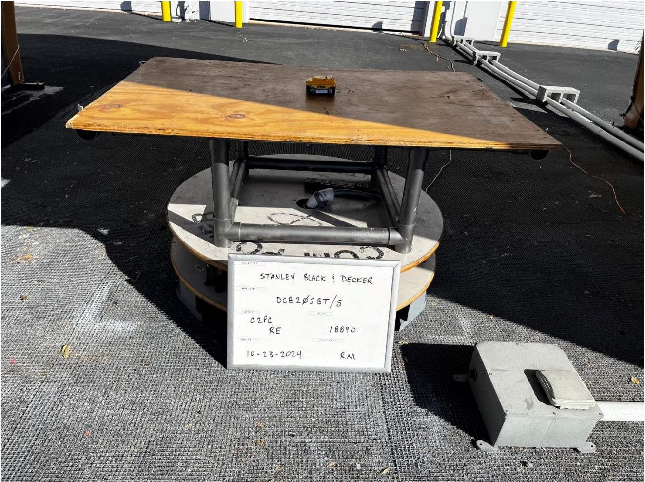
Radiated Emissions View 4, <1GHz