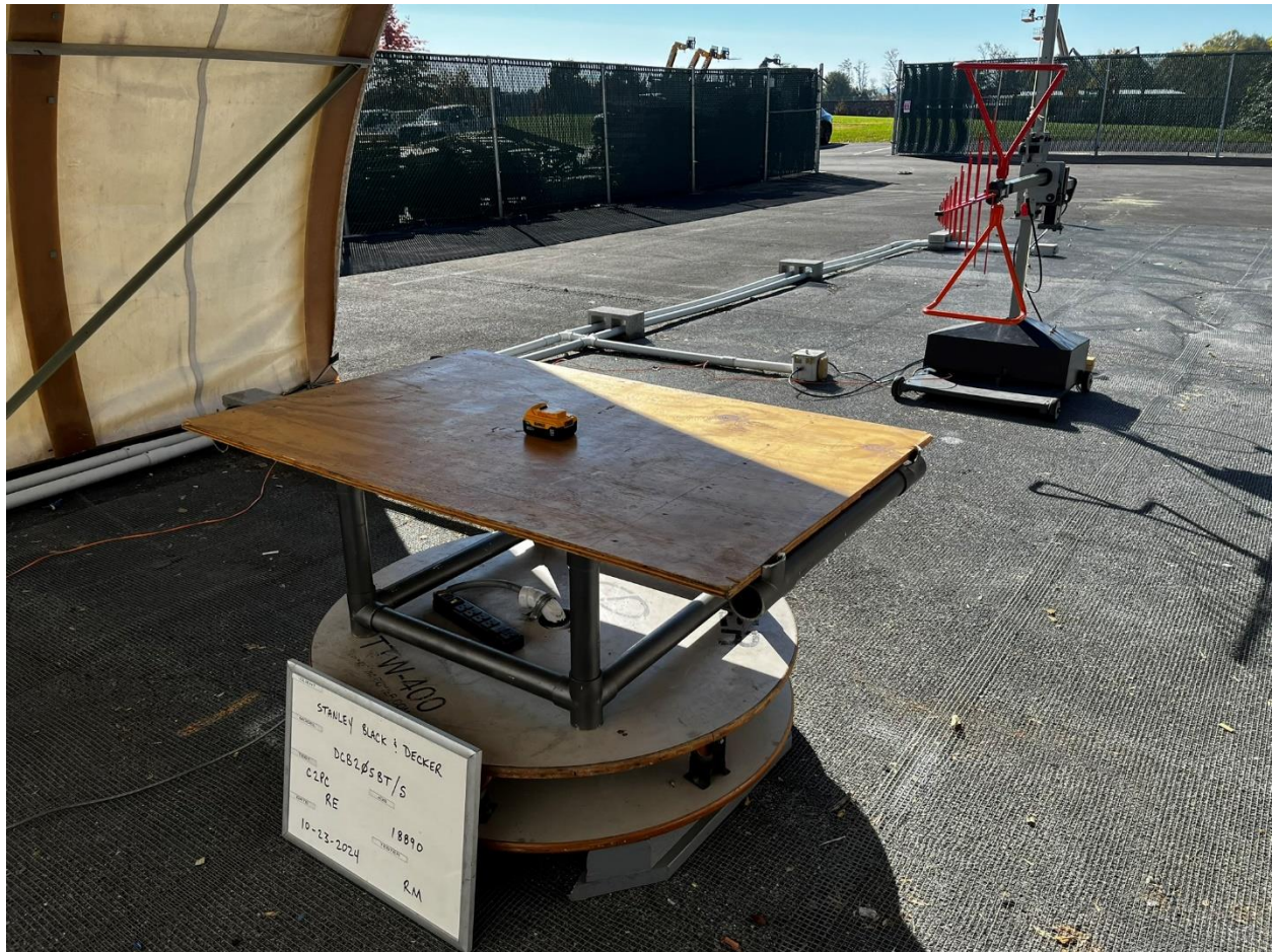
Radiated Emissions View 2, <1GHz