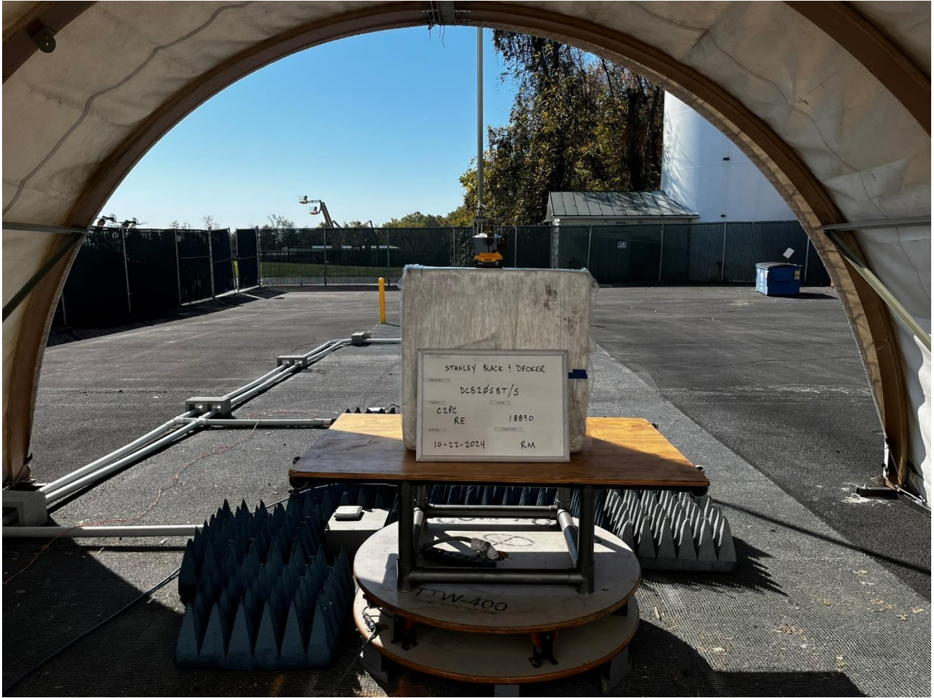
Radiated Emissions View 1, >1GHz