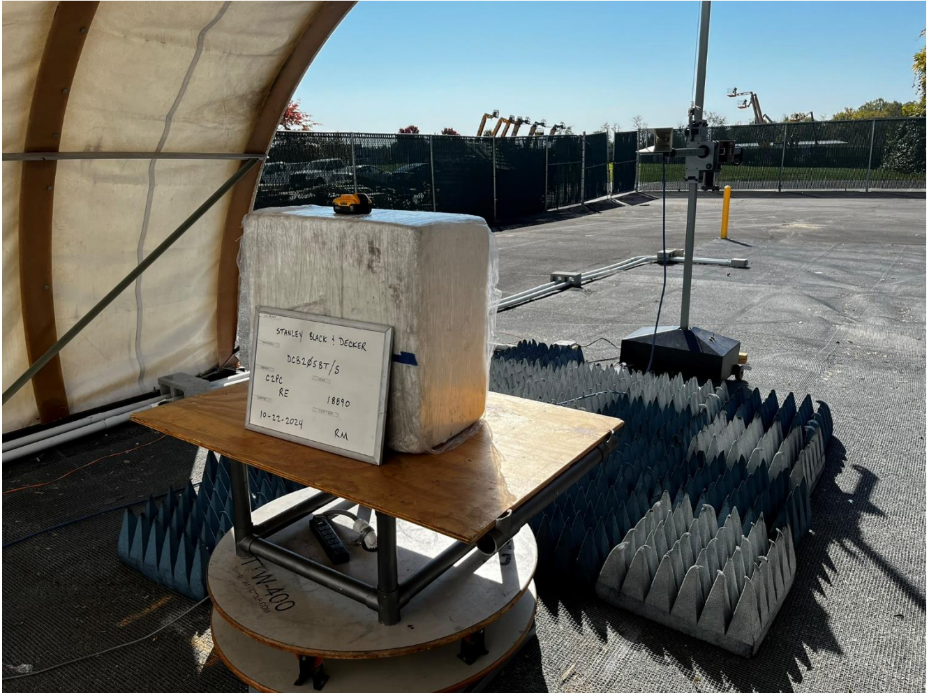
Radiated Emissions View 2, >1GHz