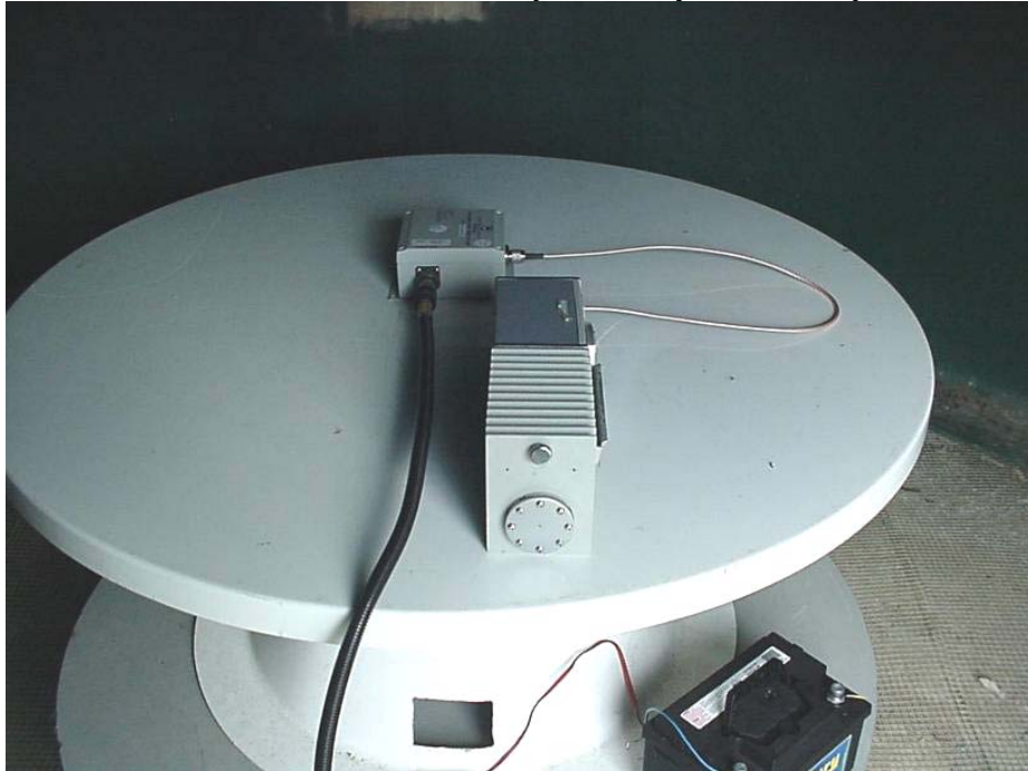
Radiated emissions test set up – Dummy load on output