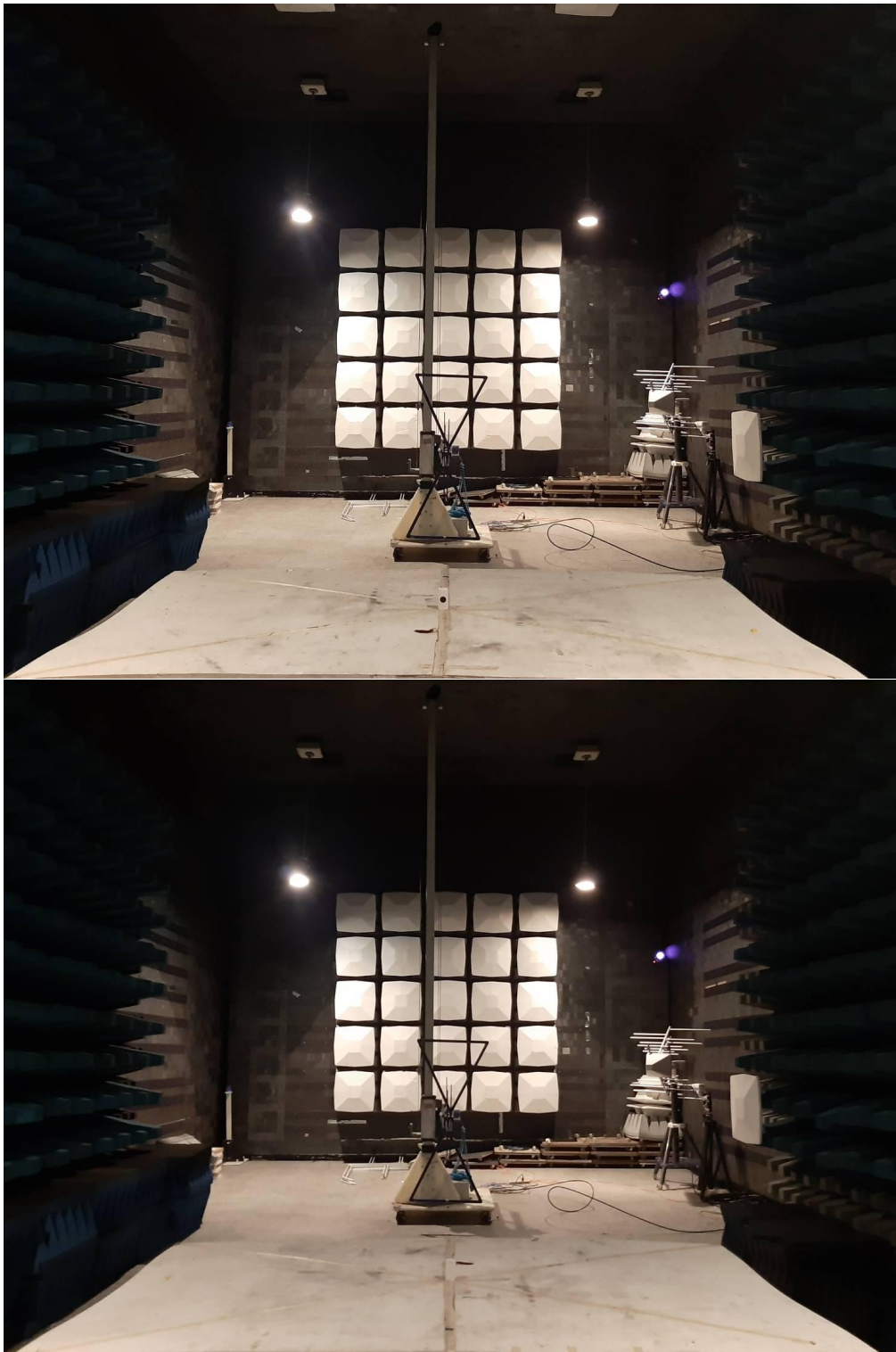
Radiated emission Above 1G