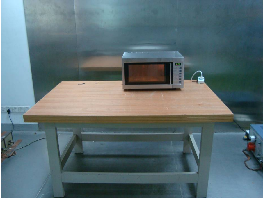
Conduction Emissions - Side View