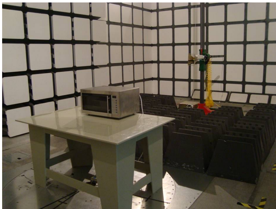
Radiated Emissions - Rear View (Above 1 GHz)