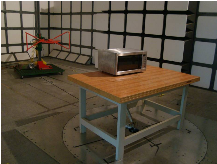
Radiated Emissions - Rear View (30 MHz-1 GHz)