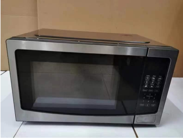
Original report model: E30PXP22-A00