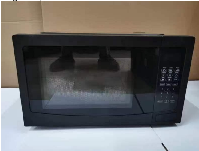
Original report model: E30PXP19-A00