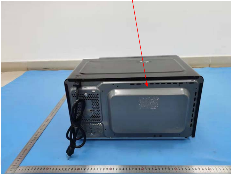
The label shown shall be permanently affixed at a conspicuous location on the device and be readily visible to the time purchase (Labeling requirements per 2.295)