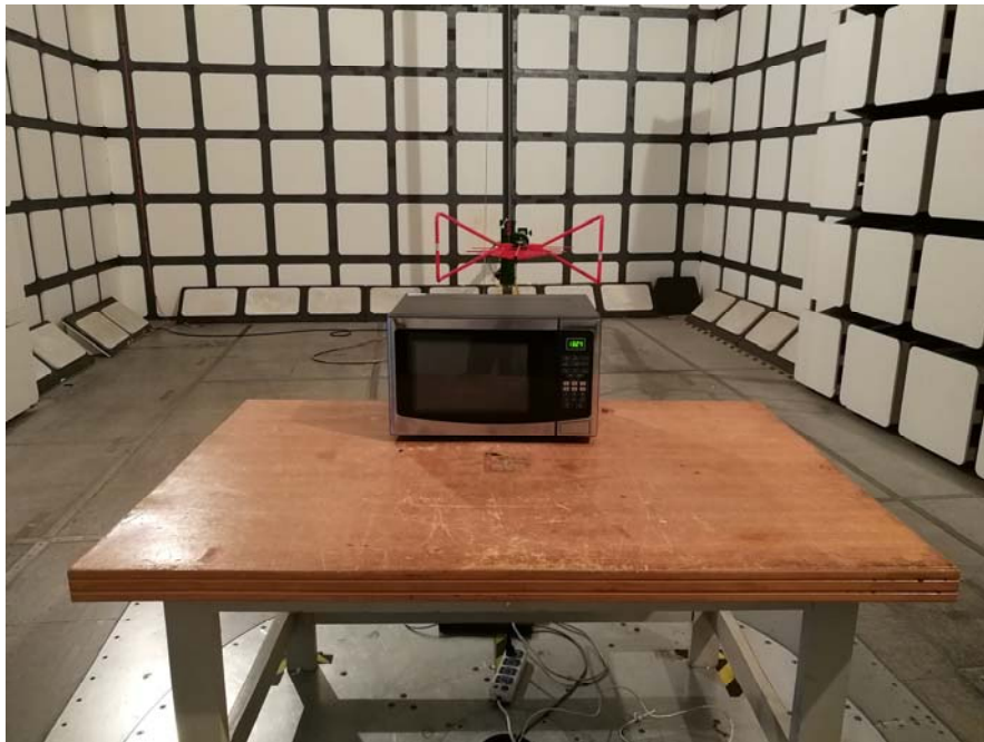
Radiated Emissions – Rear View (30 MHz – 1 GHz)