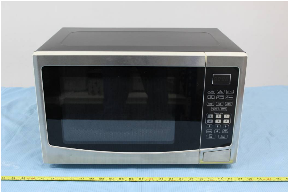
EUT – Front View