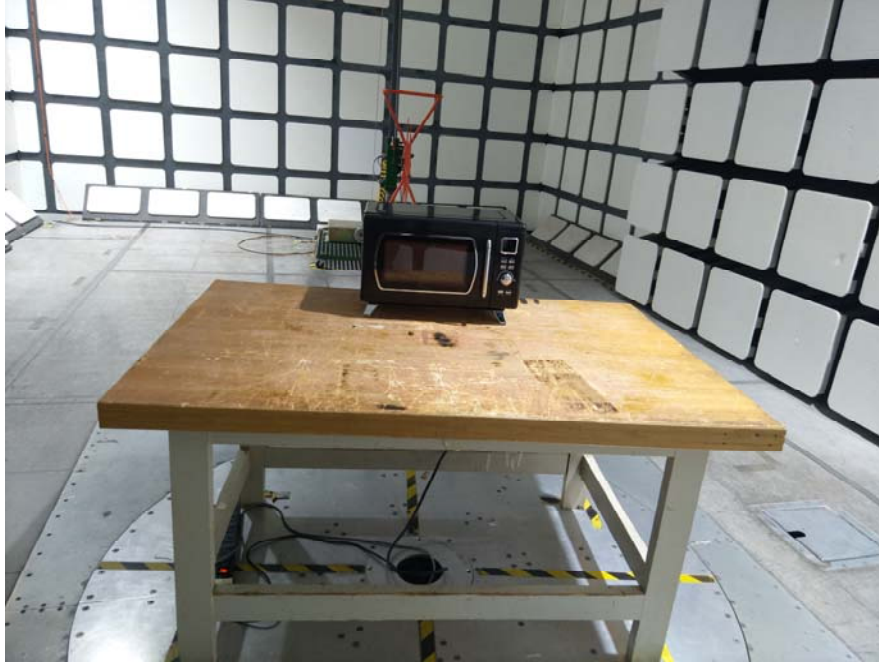
Radiated Emissions - Rear View (30 MHz – 1 GHz)