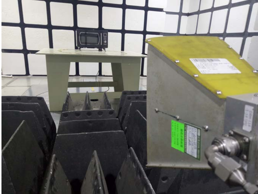
Radiated Emissions - Rear View (Above 1 GHz)