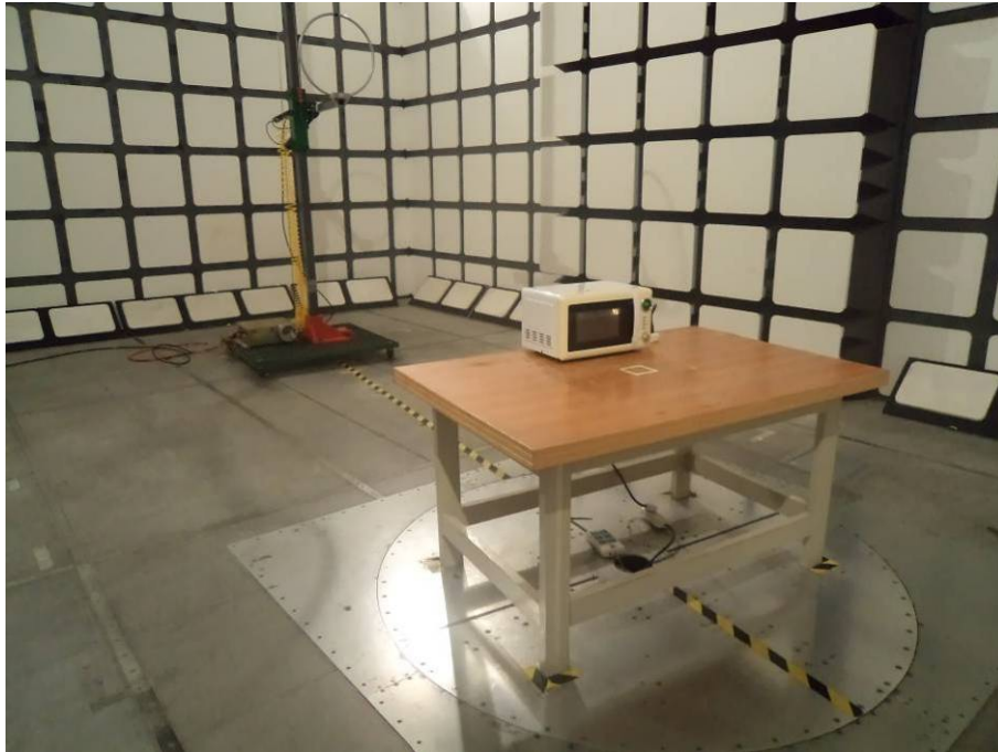
Radiated Emissions - Rear View (9 kHz – 30 MHz)