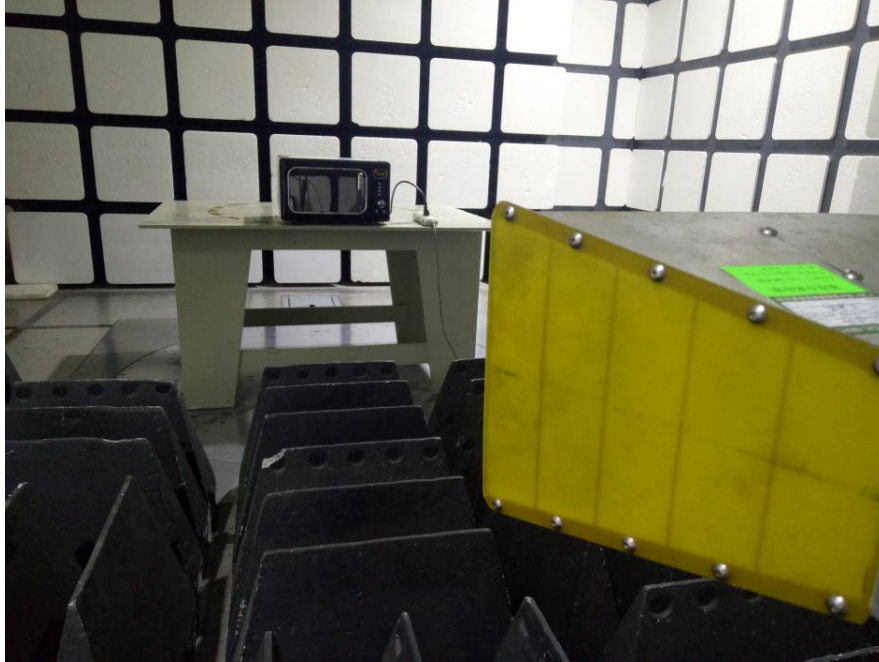
Radiated Emissions - Rear View (Above 1 GHz)