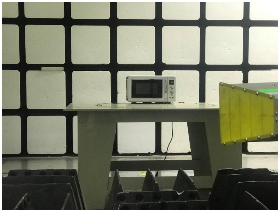
Radiated Emissions - Rear View (Above 1 GHz)