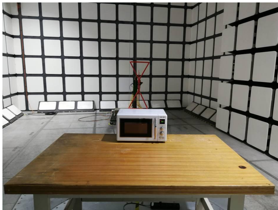
Radiated Emissions - Rear View (30 MHz – 1 GHz)