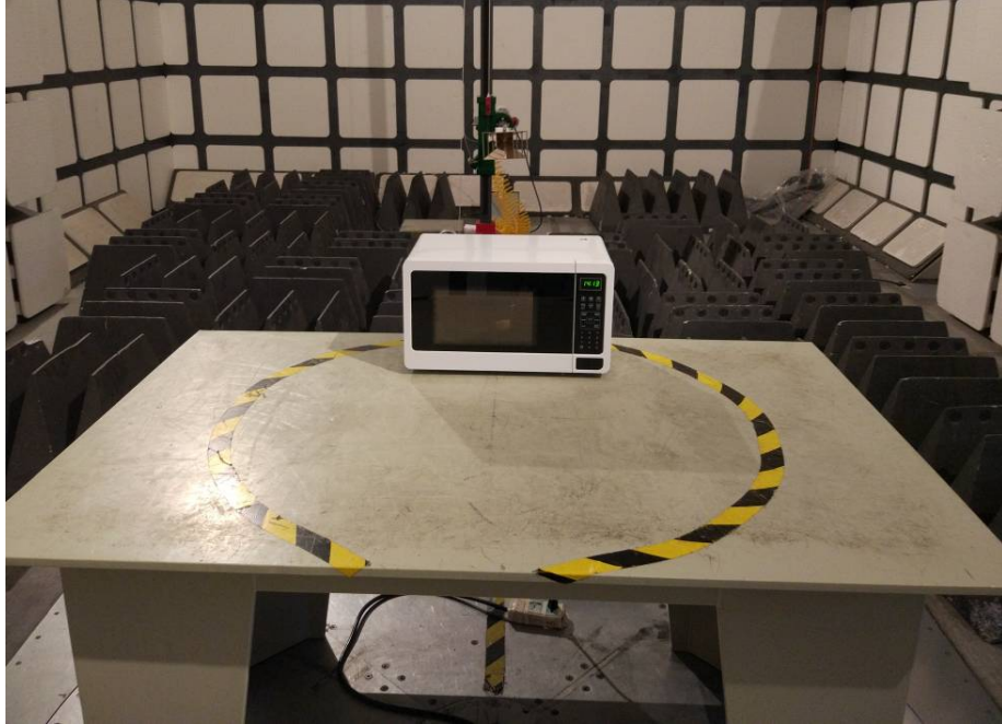
Radiated Emissions - Rear View (Above 1 GHz)