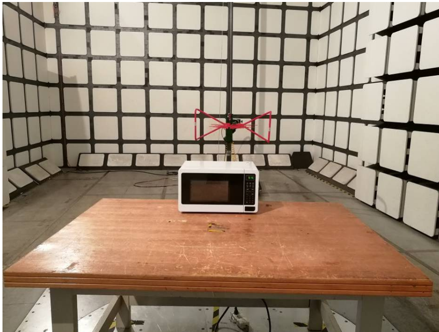
Radiated Emissions – Rear View (30 MHz – 1 GHz)