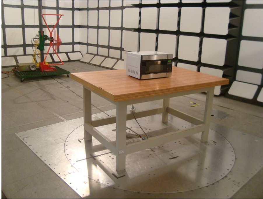
Radiated Emissions - Rear View (30 MHz-1 GHz)