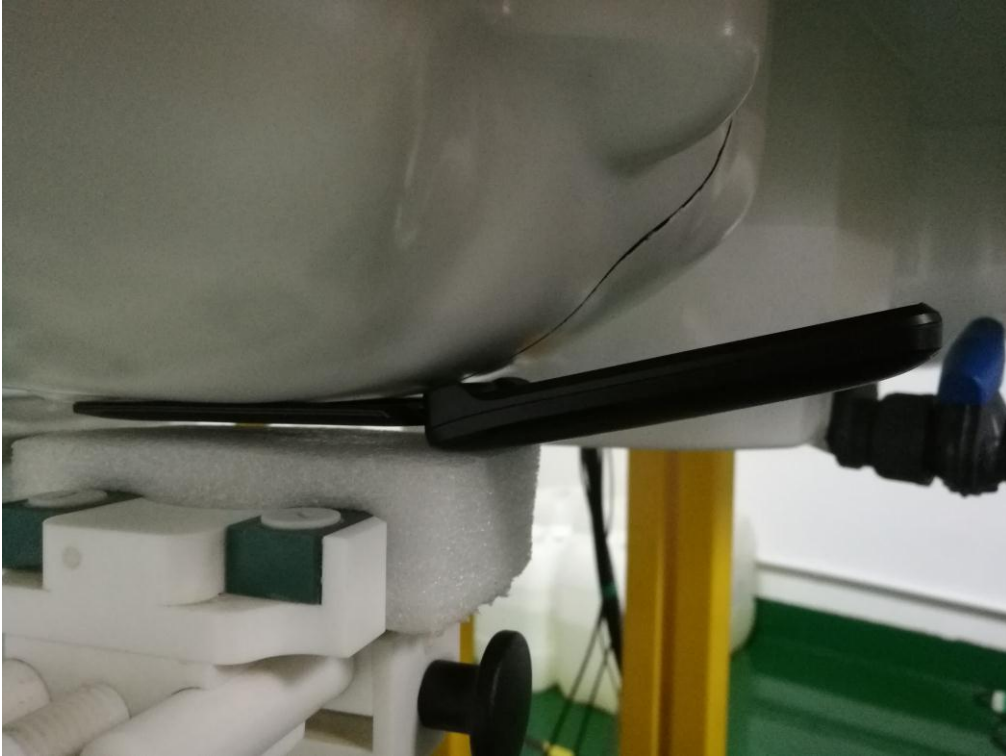
Right Head Tilt View