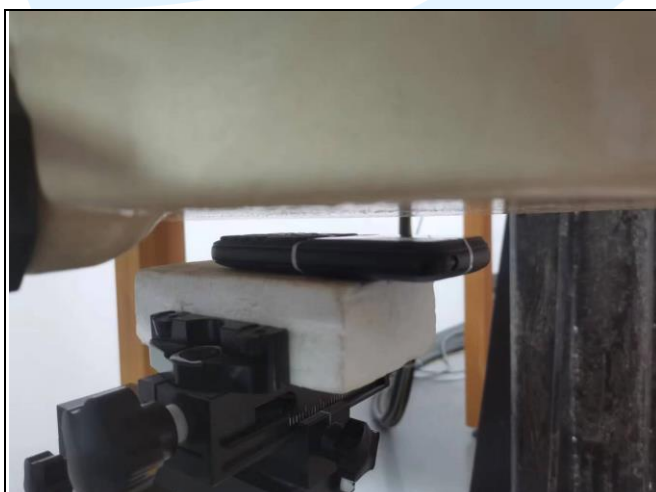
Front Face of EUT with 1.0 cm Gap