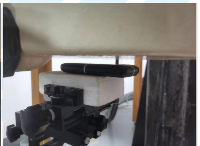
Rear Face of EUT with 1.0 cm Gap