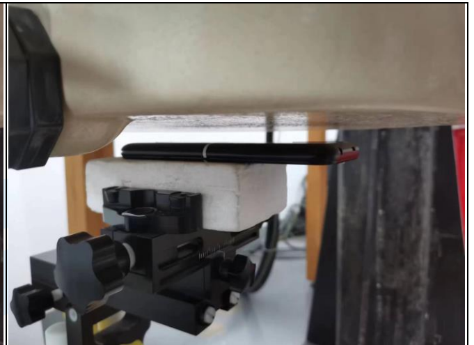
Rear Face of EUT with 1.0 cm Gap