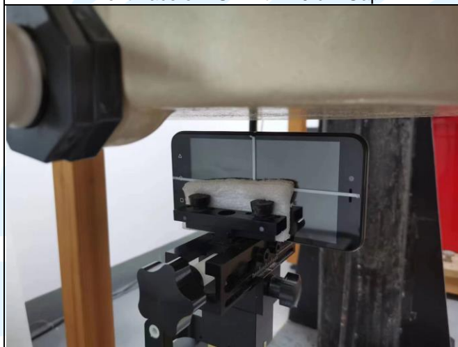
Left Side of EUT with 1.0 cm Gap