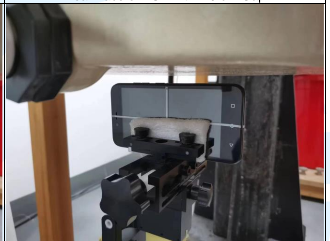
Right Side of EUT with 1.0 cm Gap