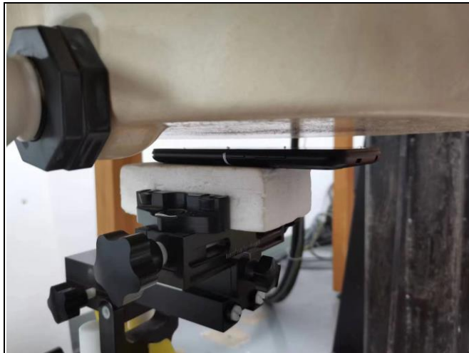
Front Face of EUT with 1.0 cm Gap