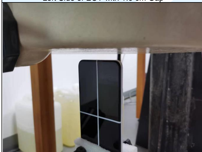
Top Side of EUT with 1.0 cm Gap