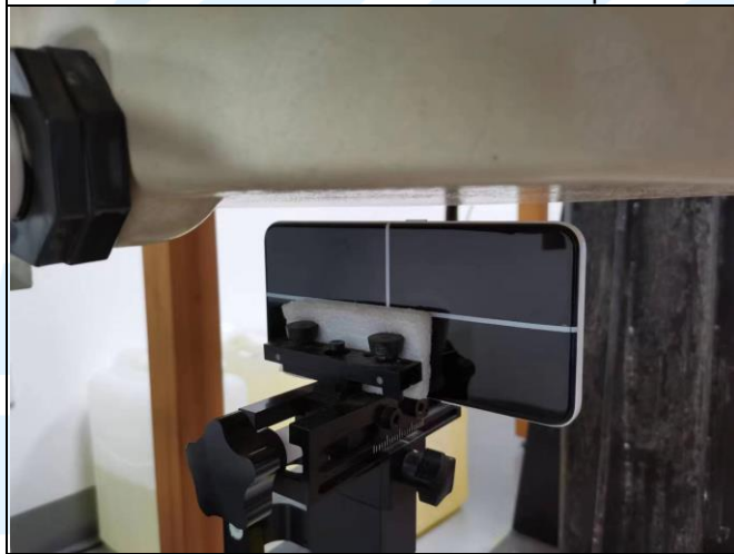
Left Side of EUT with 1.0 cm Gap