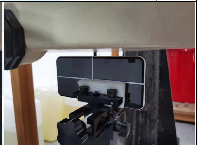
Right Side of EUT with 1.0 cm Gap