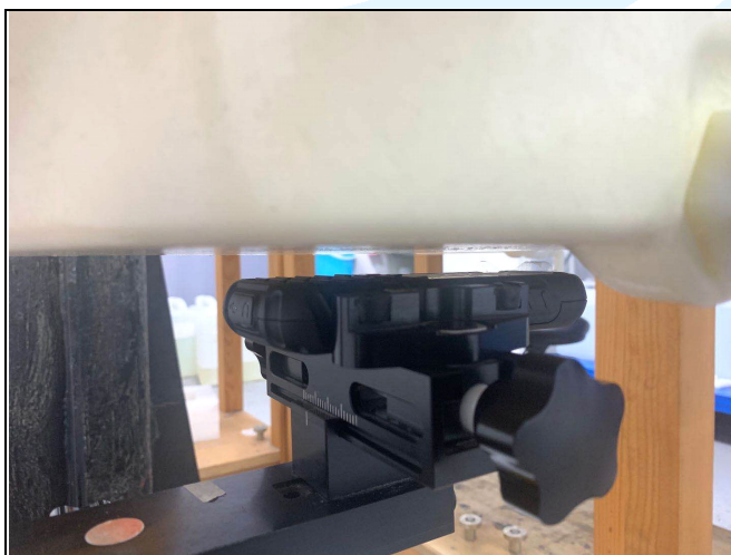
Front Face of EUT with 1.0 cm Gap