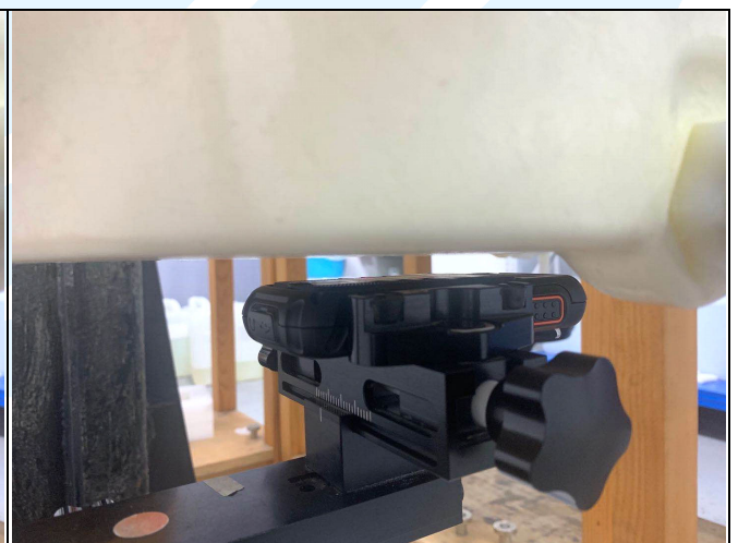
Rear Face of EUT with 1.0 cm Gap