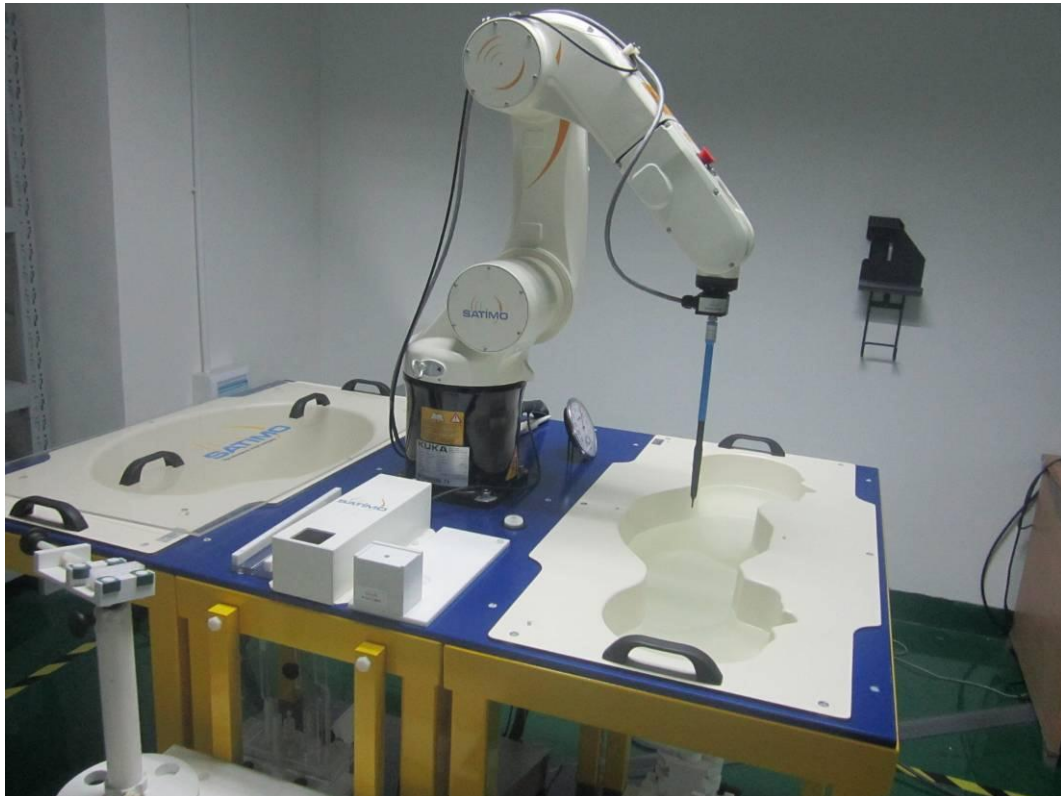
Liquid depth \geq 15\text{cm}