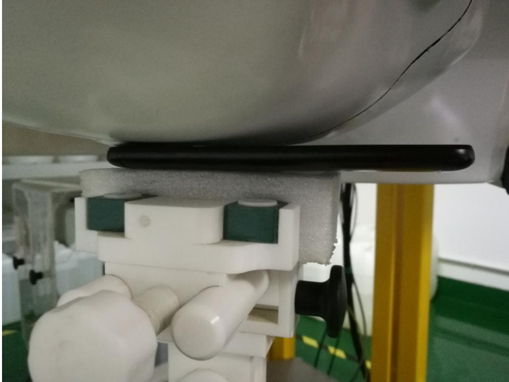
Right Head Tilt View